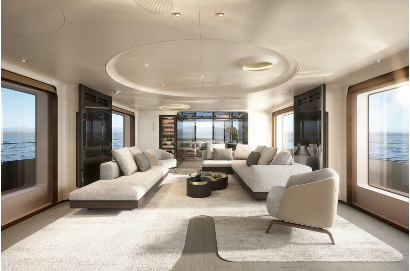
Main deck salon