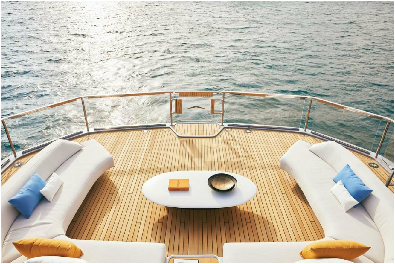
Main deck aft - sea view terrace