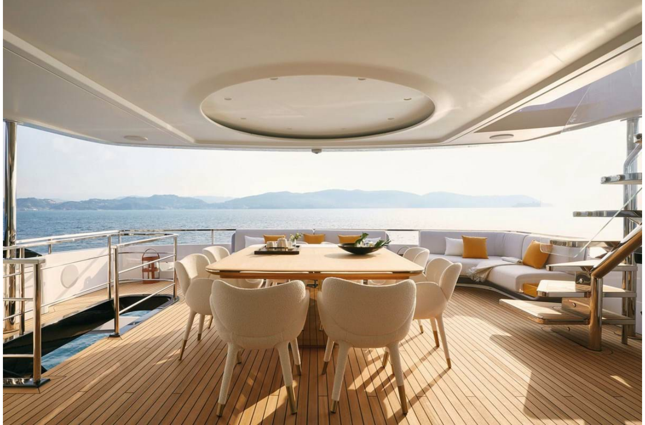
Upper deck aft