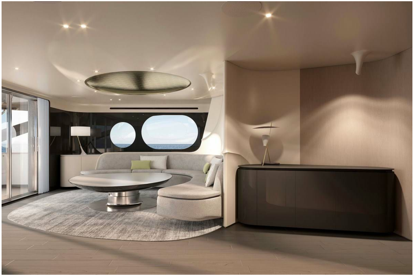
Upper deck salon