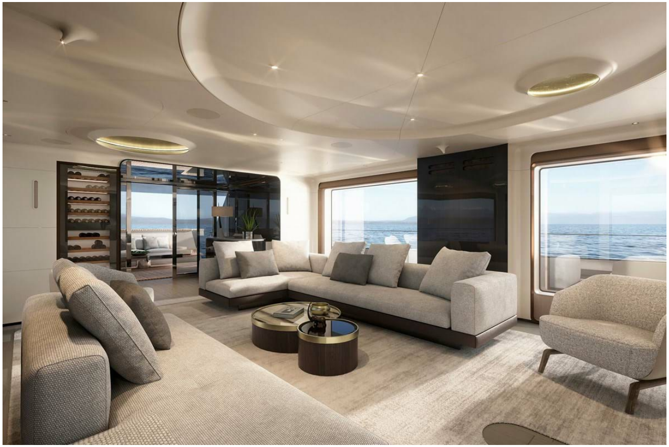
Main deck salon