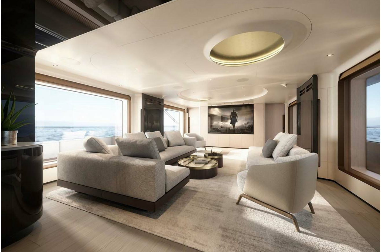
Main deck salon