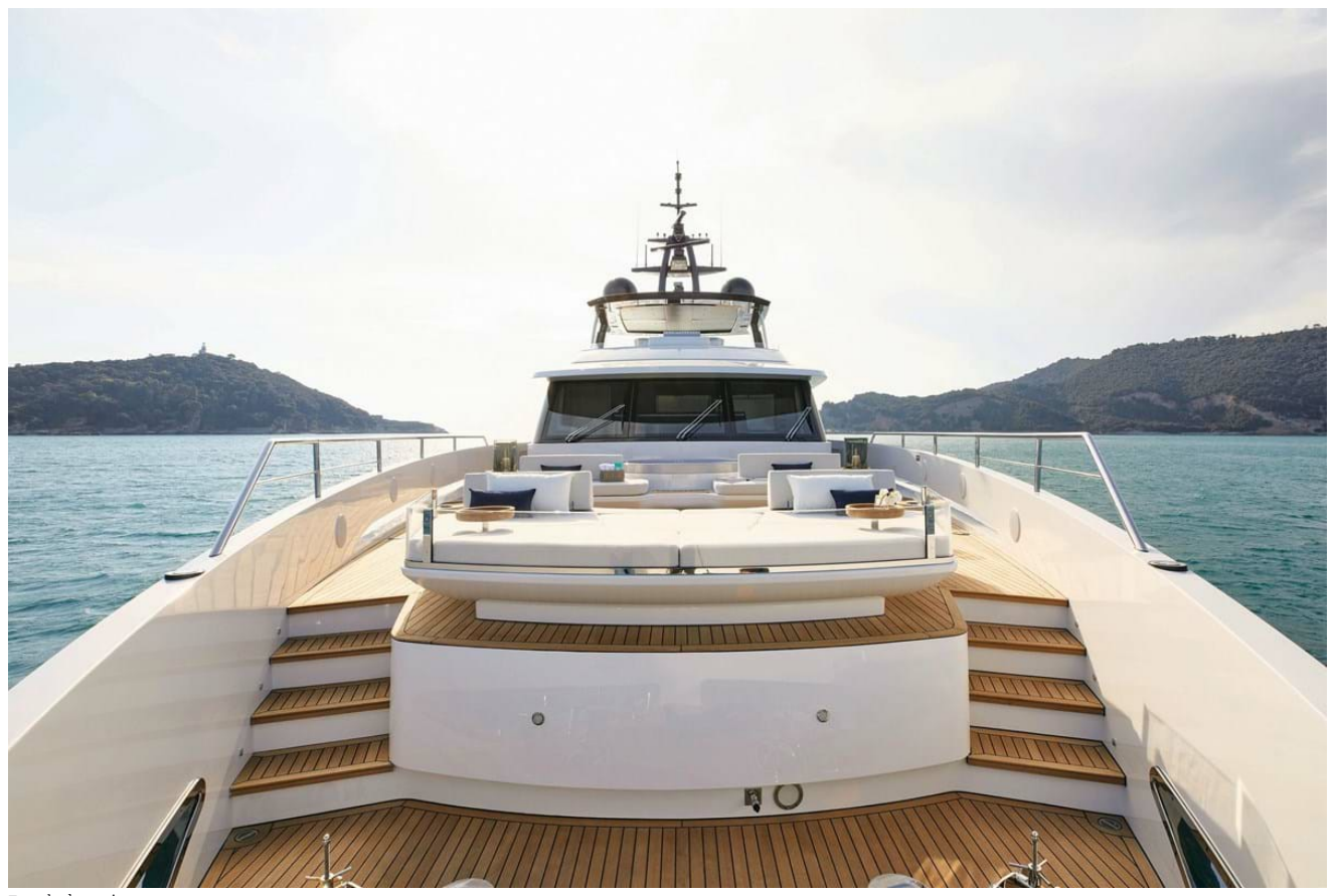
Foredeck seating area