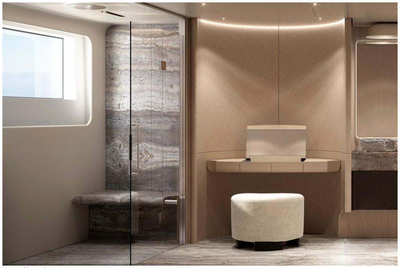
Master cabin en suite