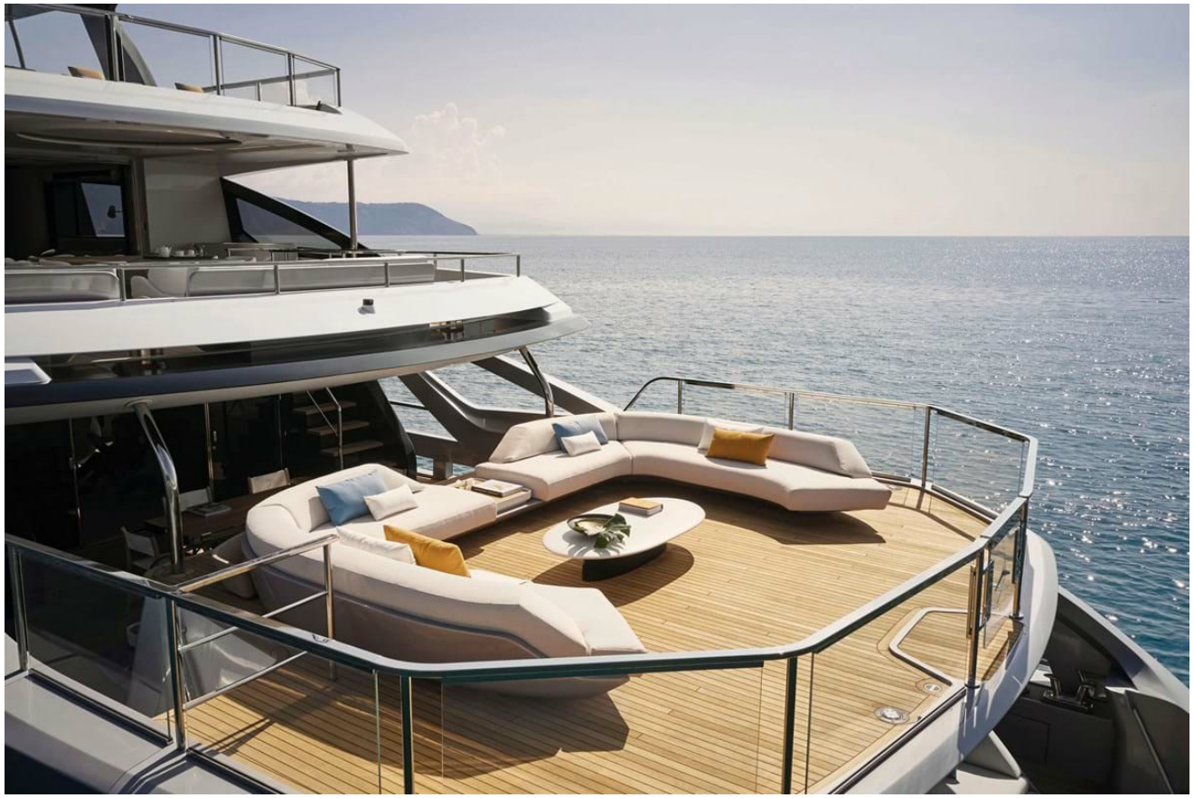
Main deck aft - sea view terrace