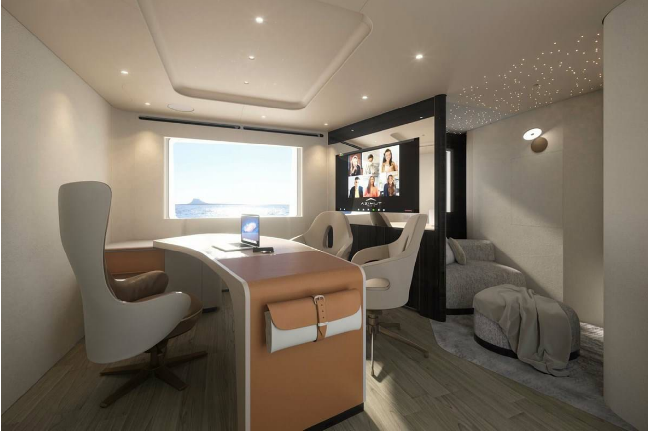
Bridge deck office