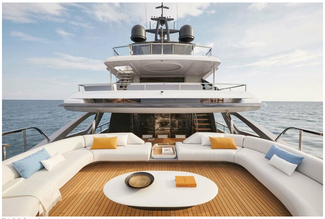
Main deck aft - sea view terrace