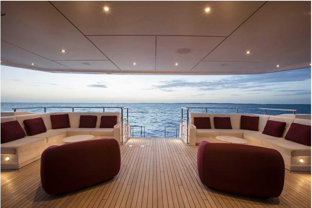
Main deck aft lounge