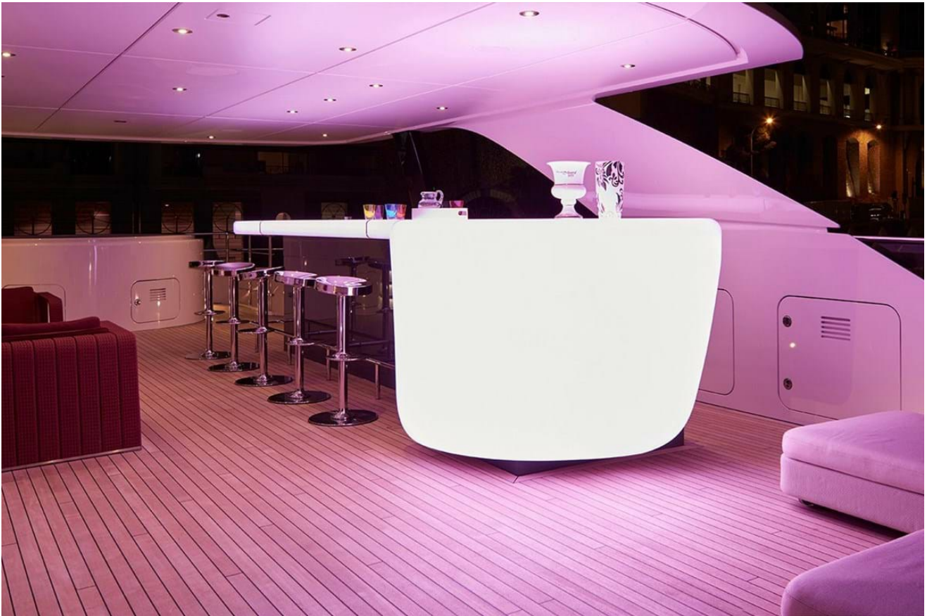
Sun deck bar