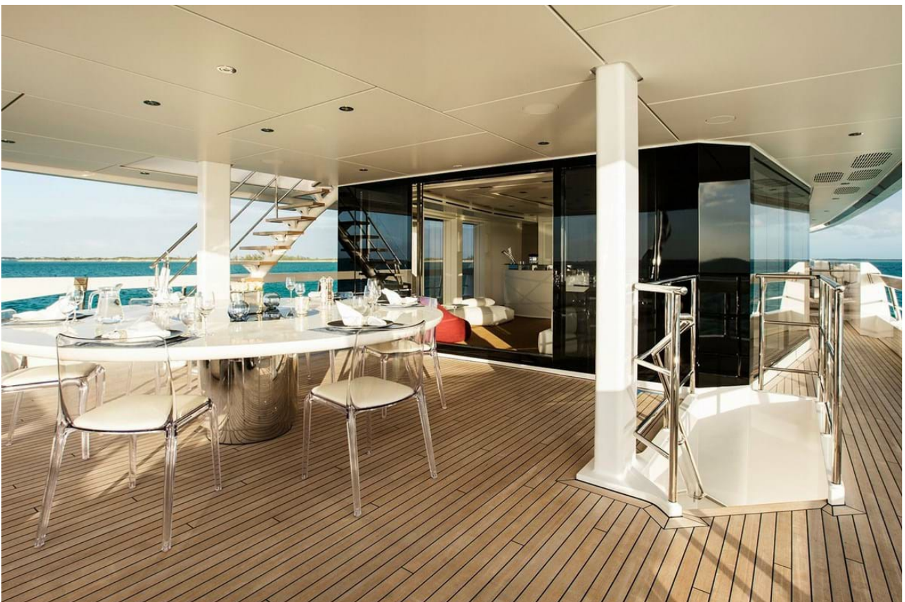
Bridge deck aft dining