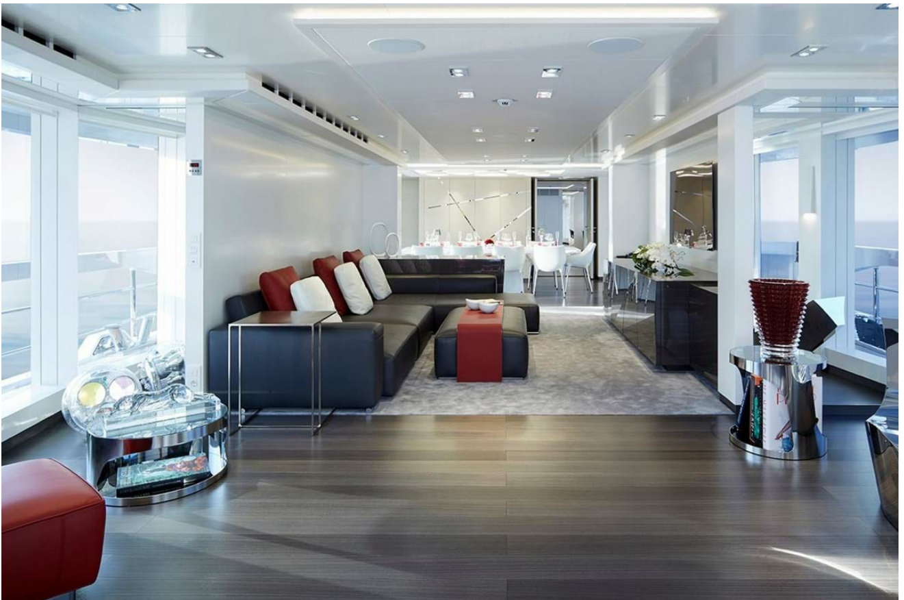
Main deck lounge