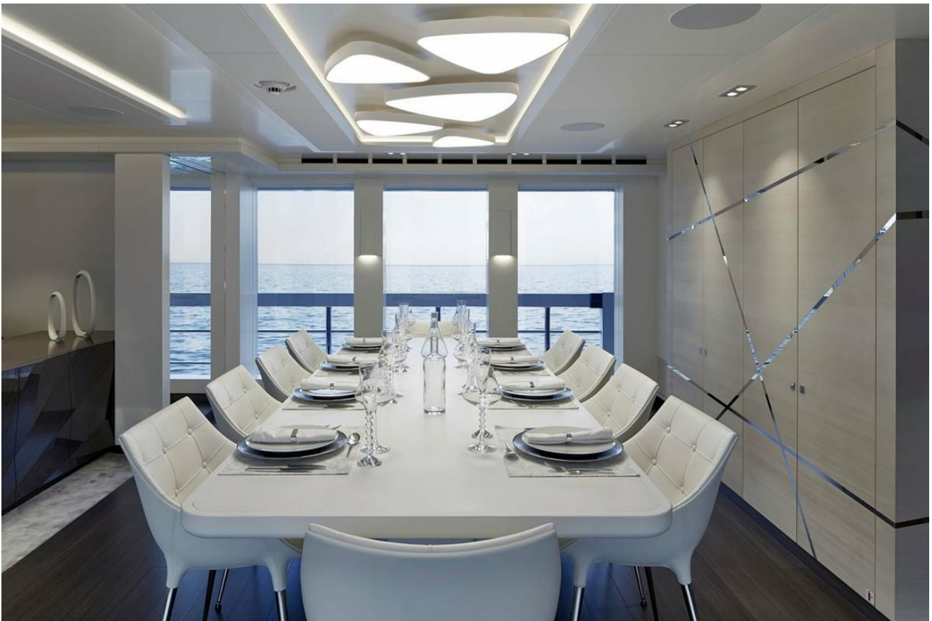
Main deck dining