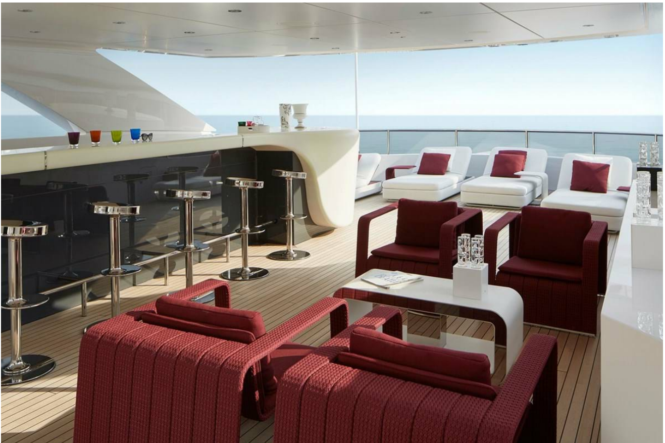
Sun deck bar and lounge