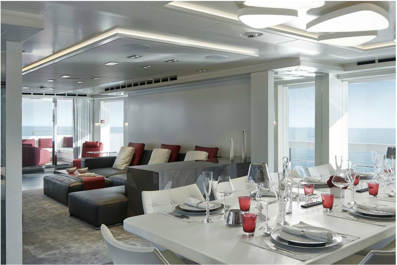
Main deck lounge