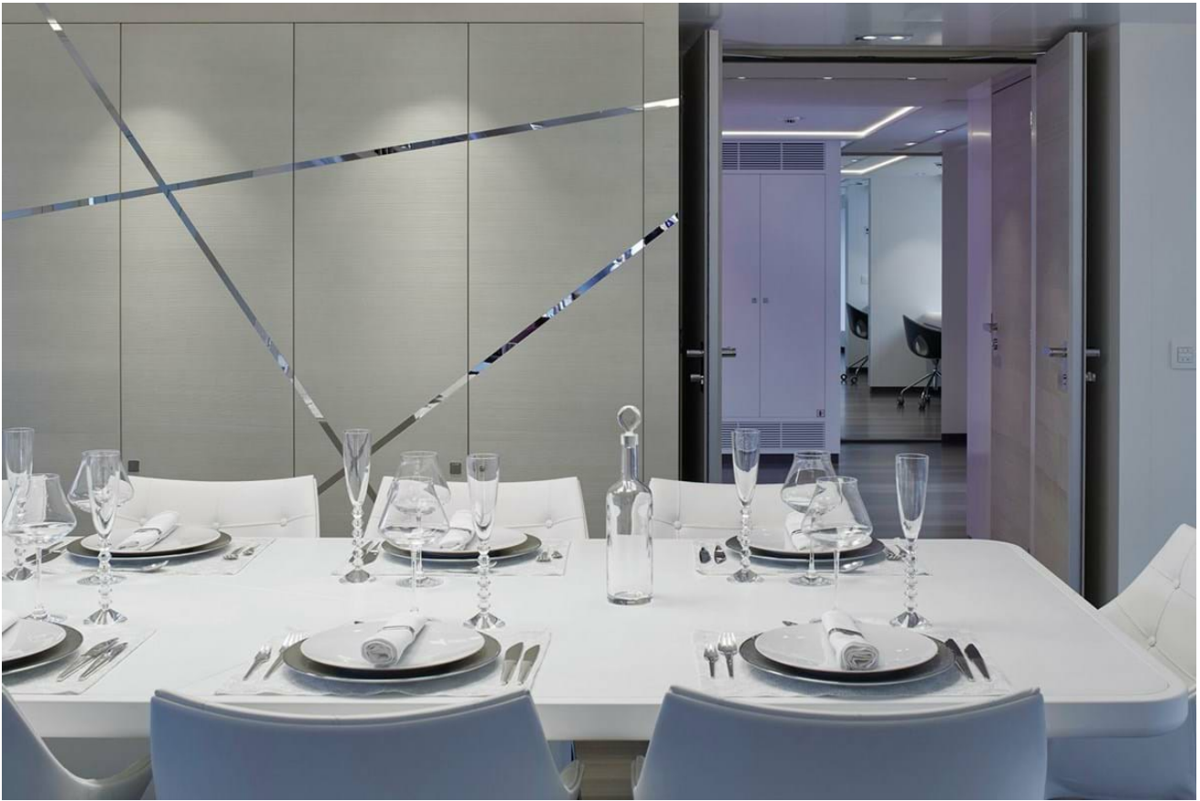
Main deck dining