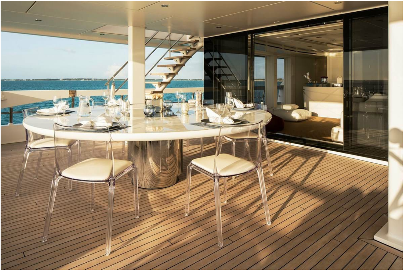
Bridge deck aft dining