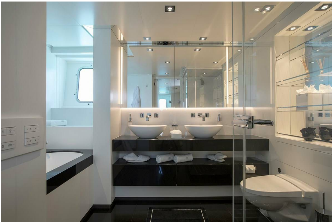
Double cabin en suite bathroom