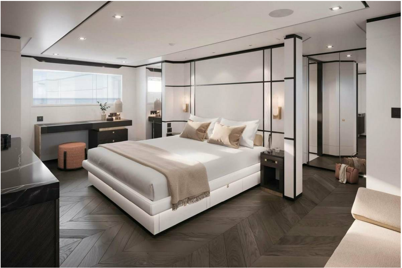
PROJECT FOX 00009409