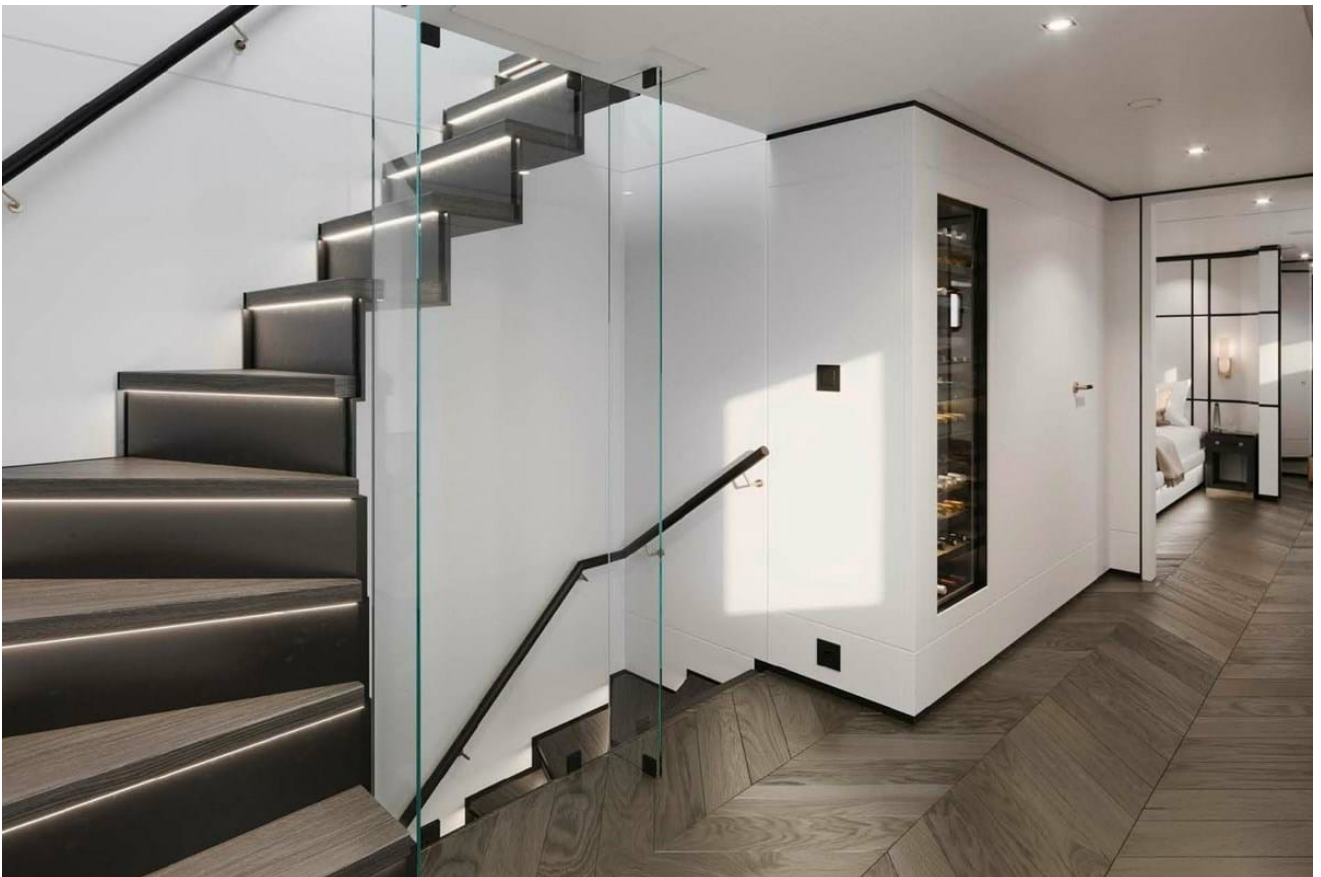
PROJECT FOX 00009409