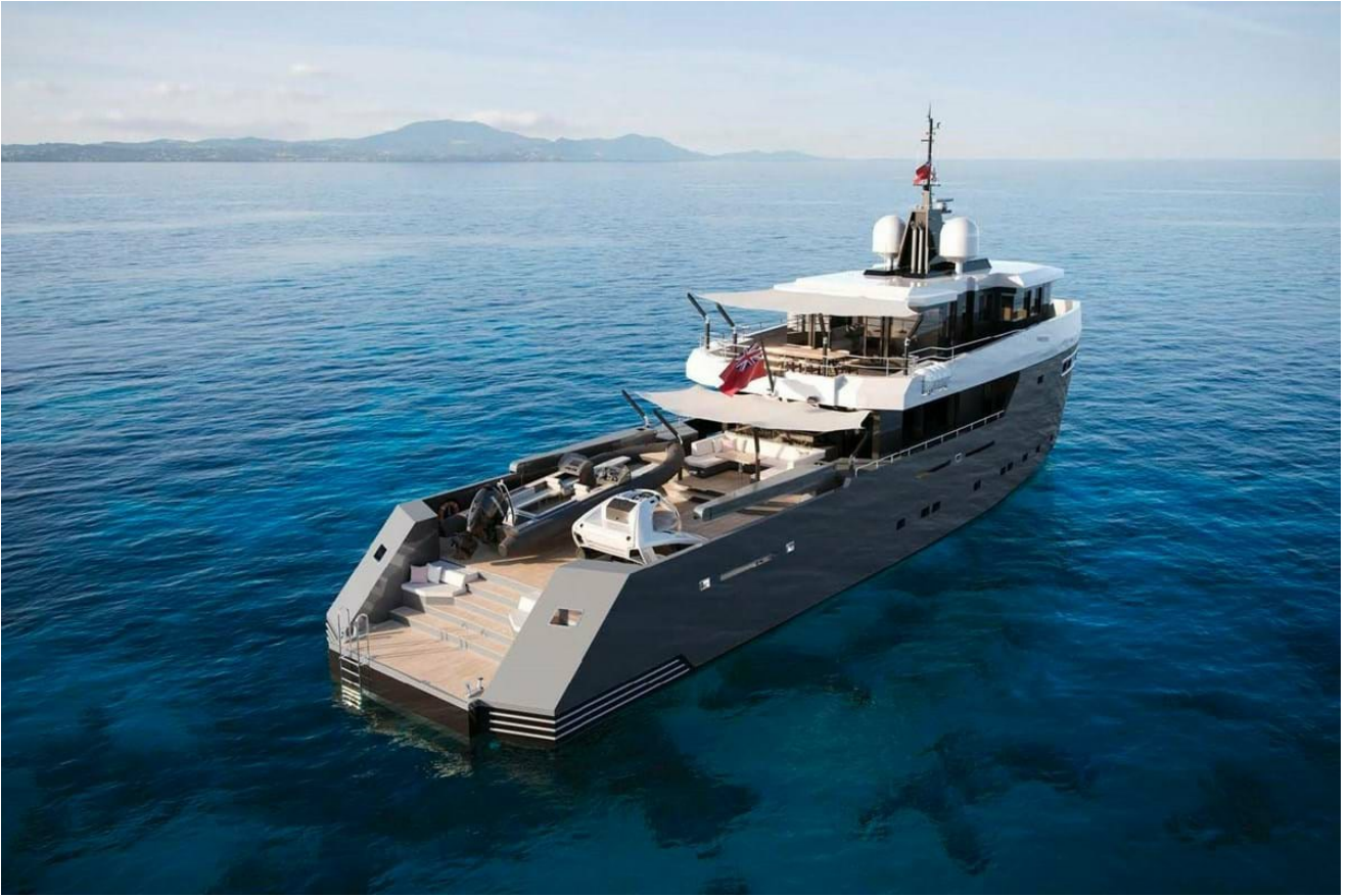
PROJECT FOX 00009409