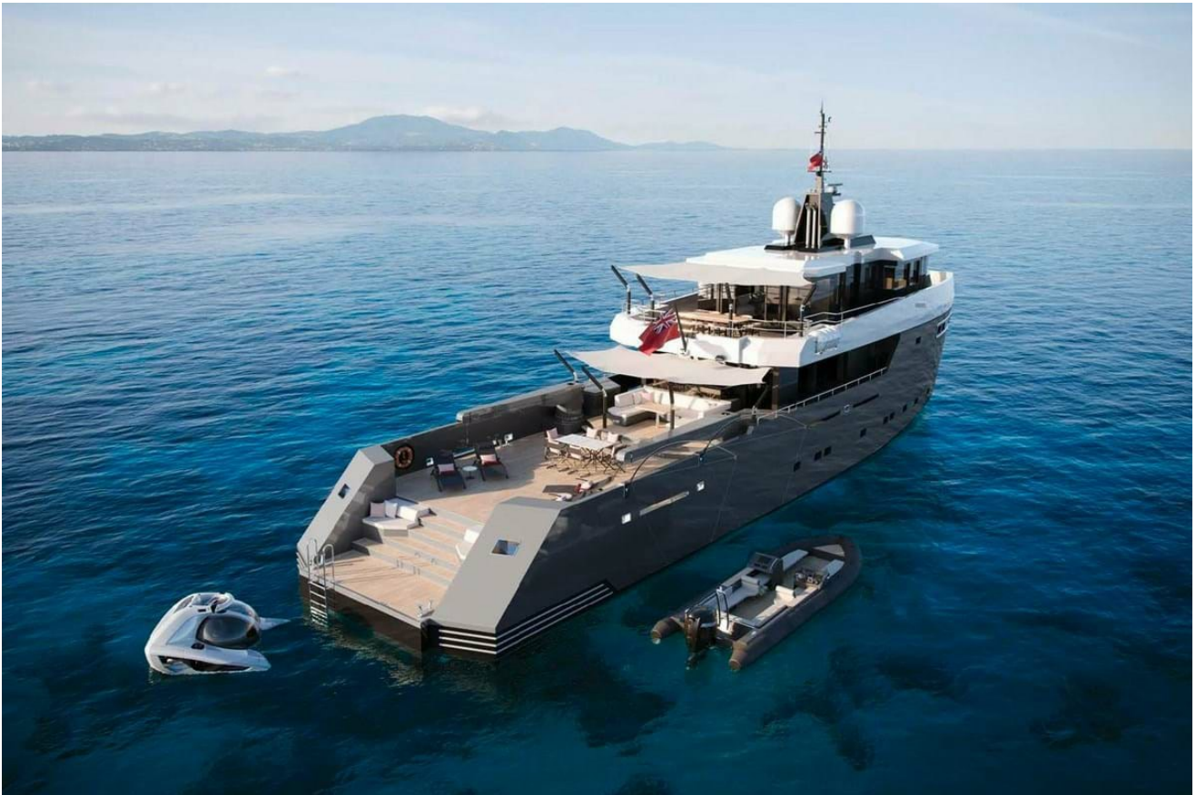
PROJECT FOX 00009409