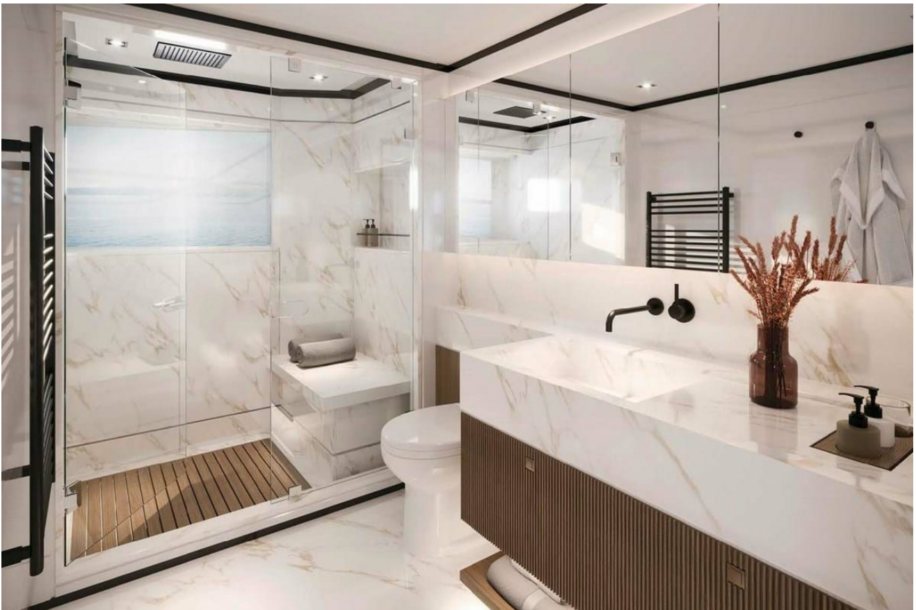
PROJECT FOX 00009409