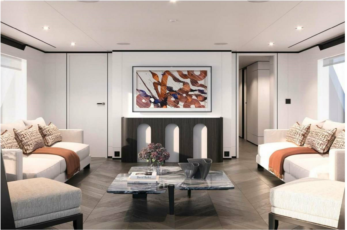
PROJECT FOX 00009409