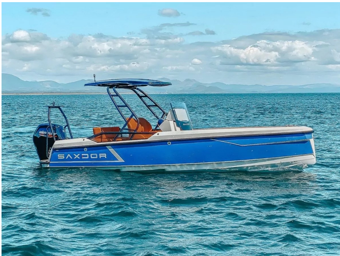
Outline specification believed to be correct but not to be taken contractually