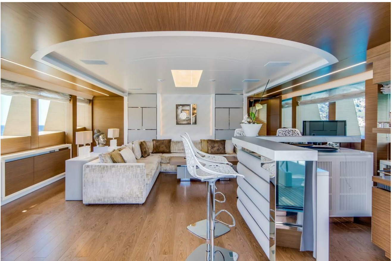
Upper deck sky lounge