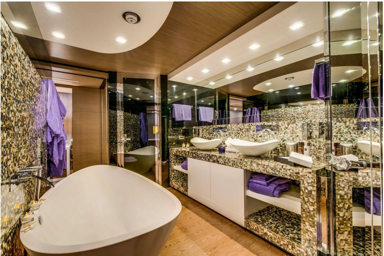
Master cabin bathroom