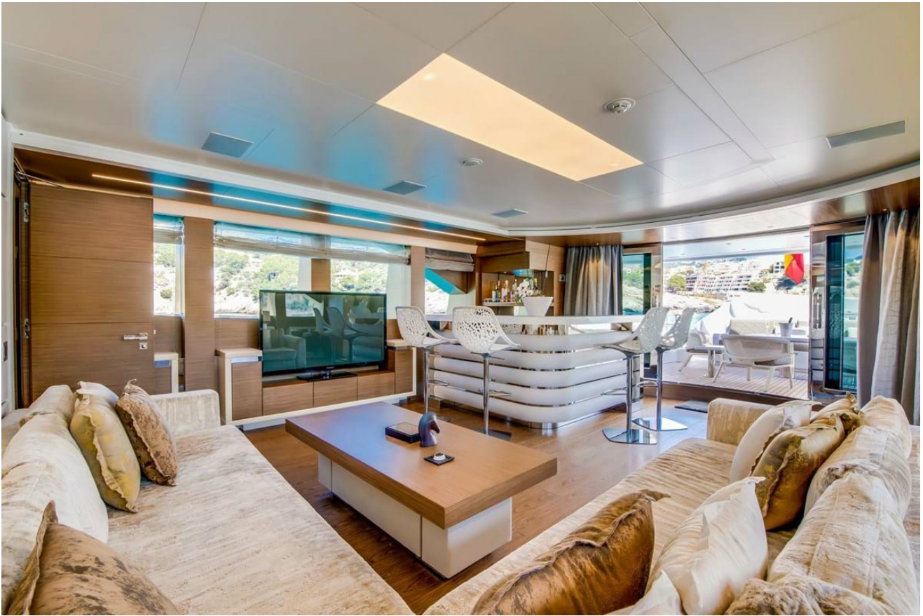
Upper deck lounge and bar area