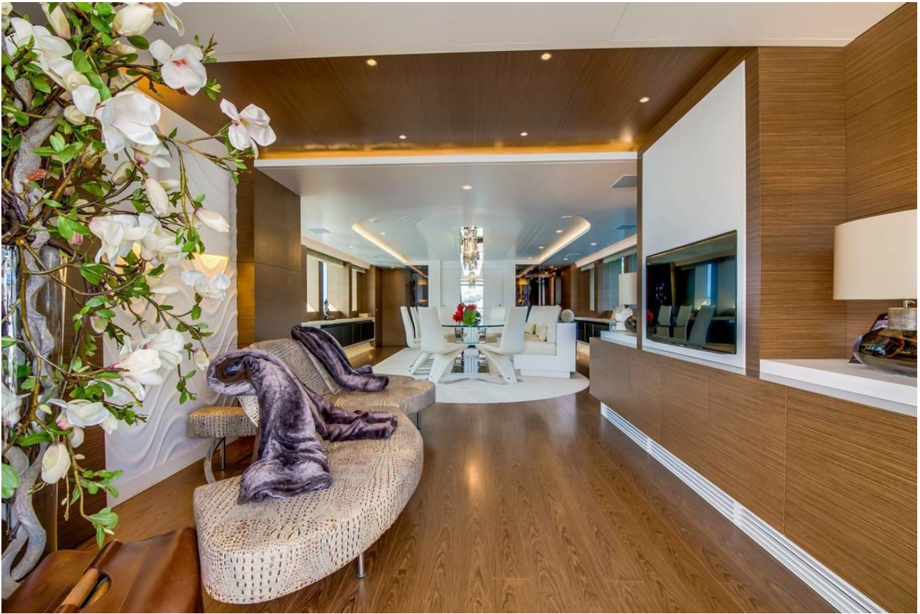
Main deck foyer and lounge