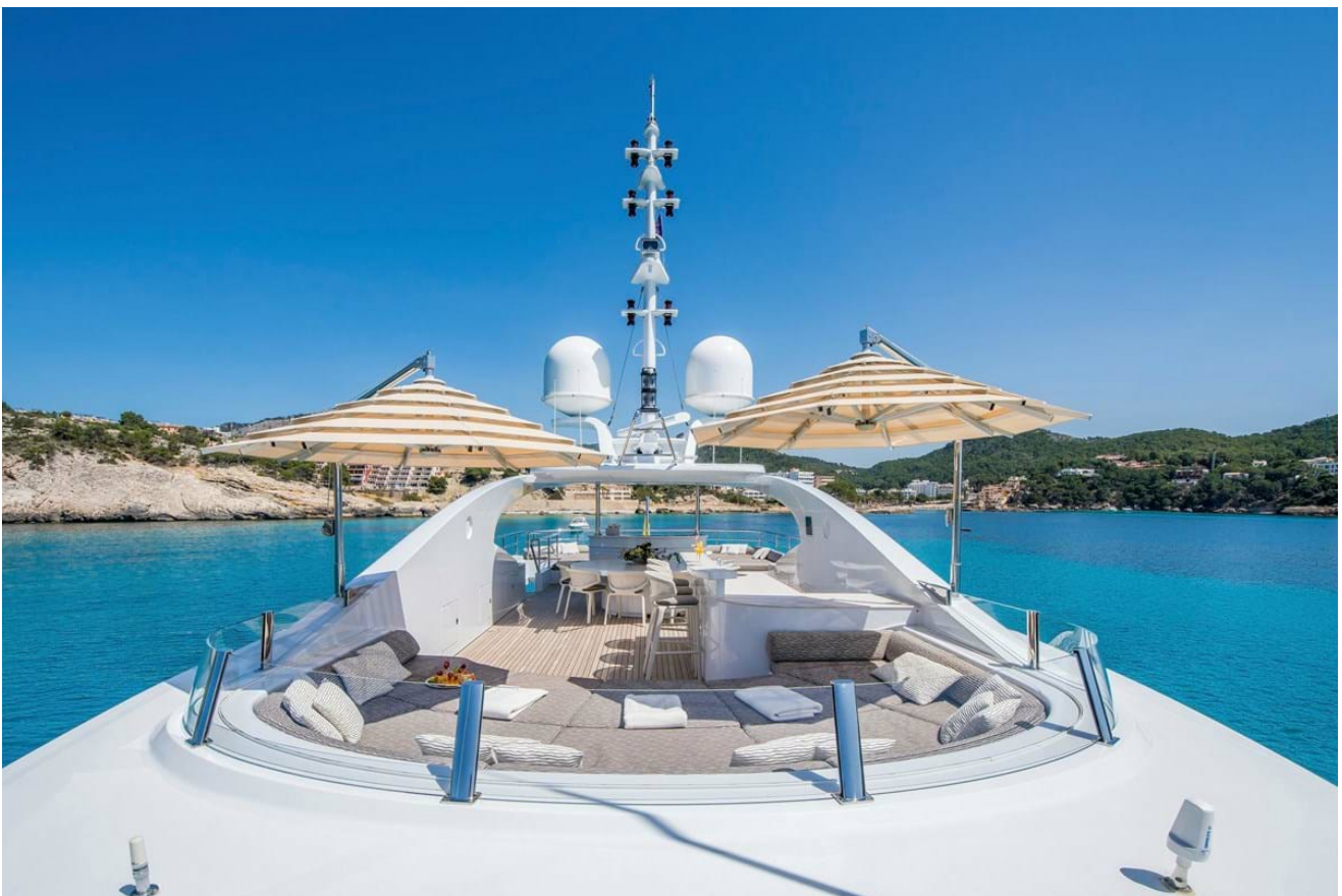
Sunloungers on sun deck