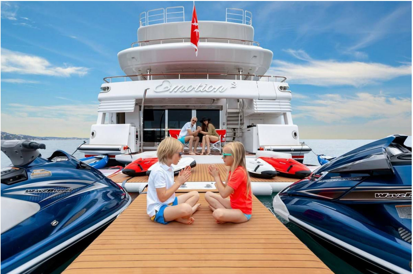
Watersports launching platform