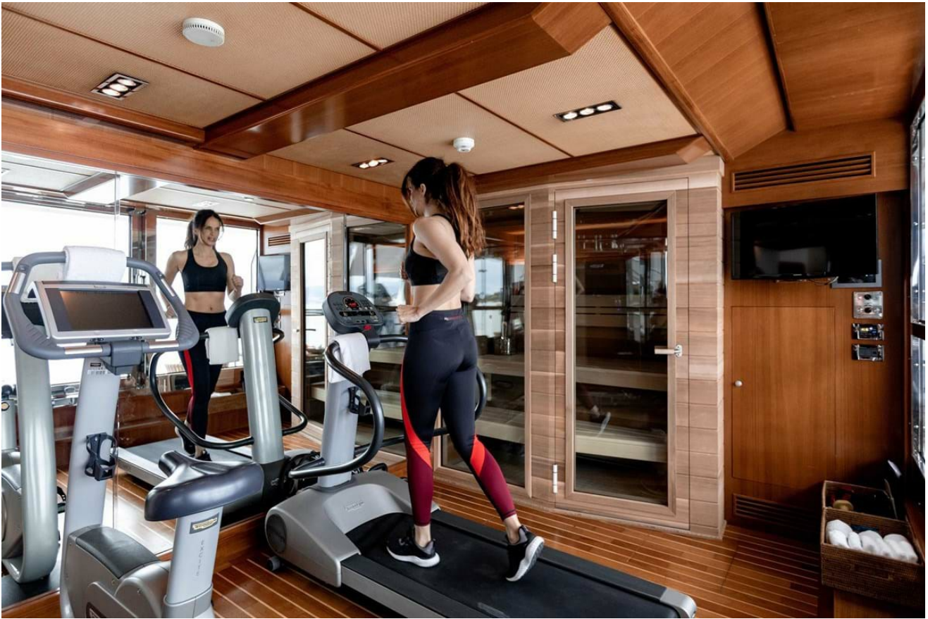
Gym with sauna