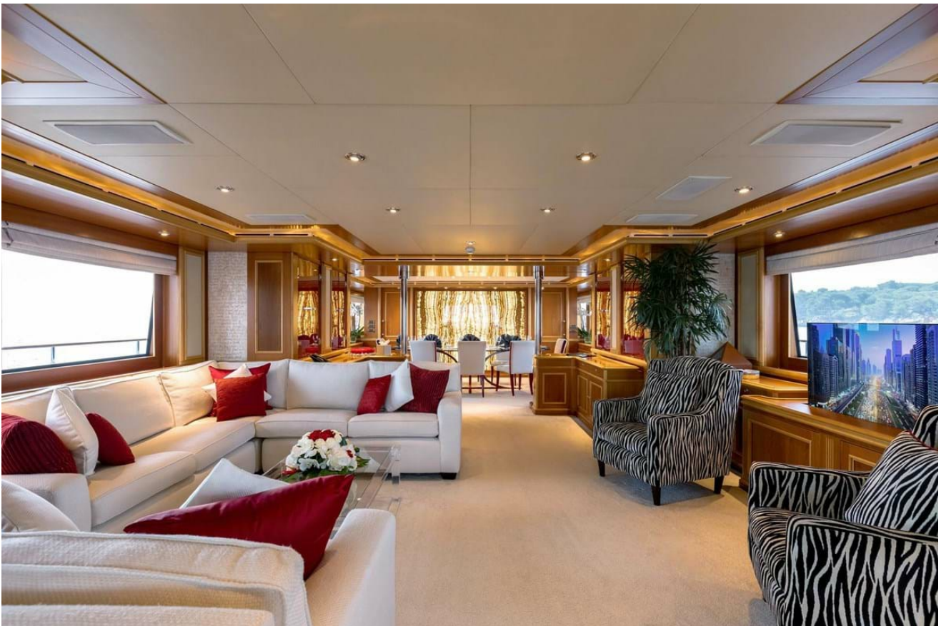
Main deck lounge