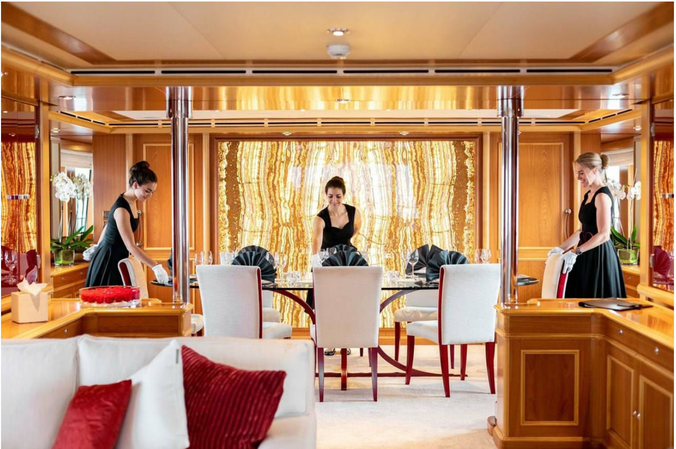
Main deck dining