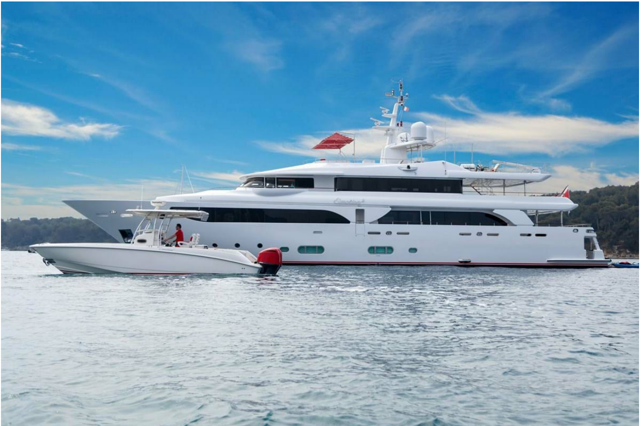
Chase boat: 9.90m Boston Whaler 320 Outrage