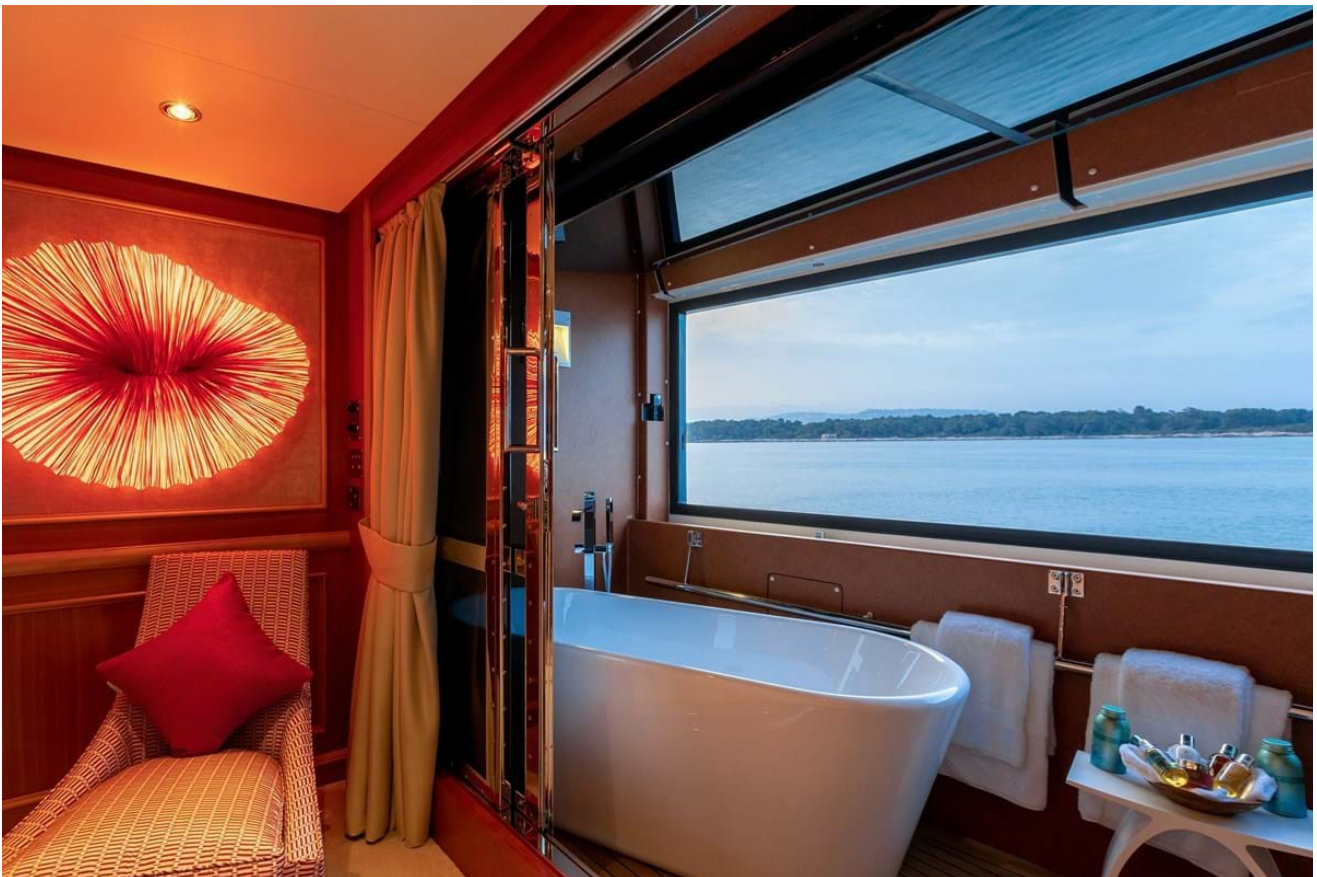
Master cabin's private balcony - bath area