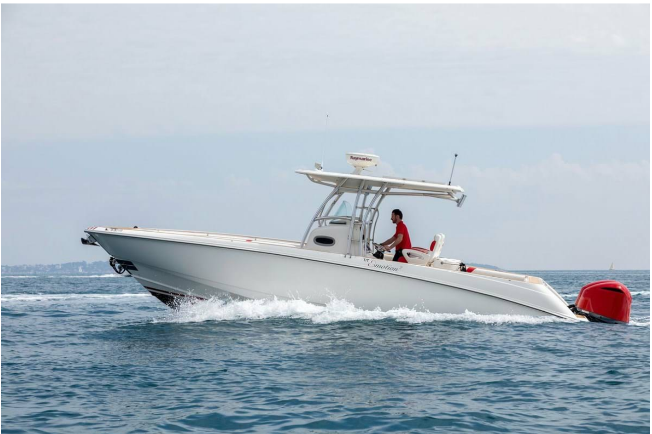
Chase boat: 9.90m Boston Whaler 320 Outrage