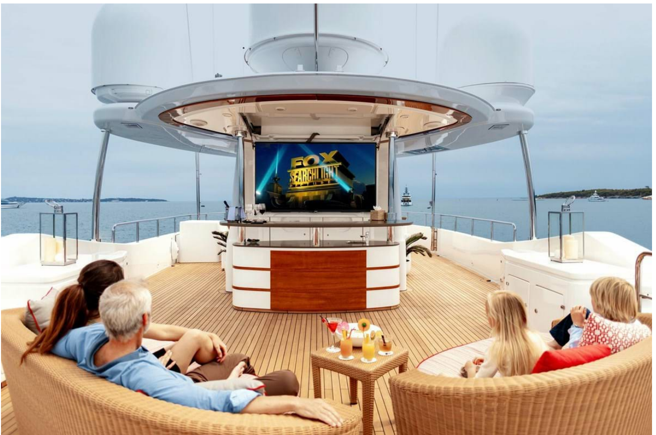
Sun deck cinema