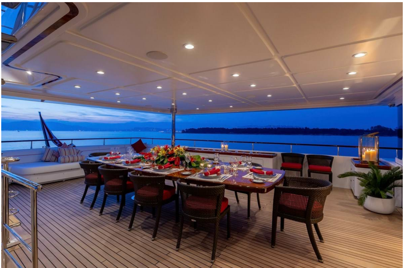
Upper deck dining area