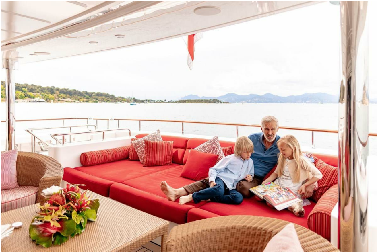
Main deck aft