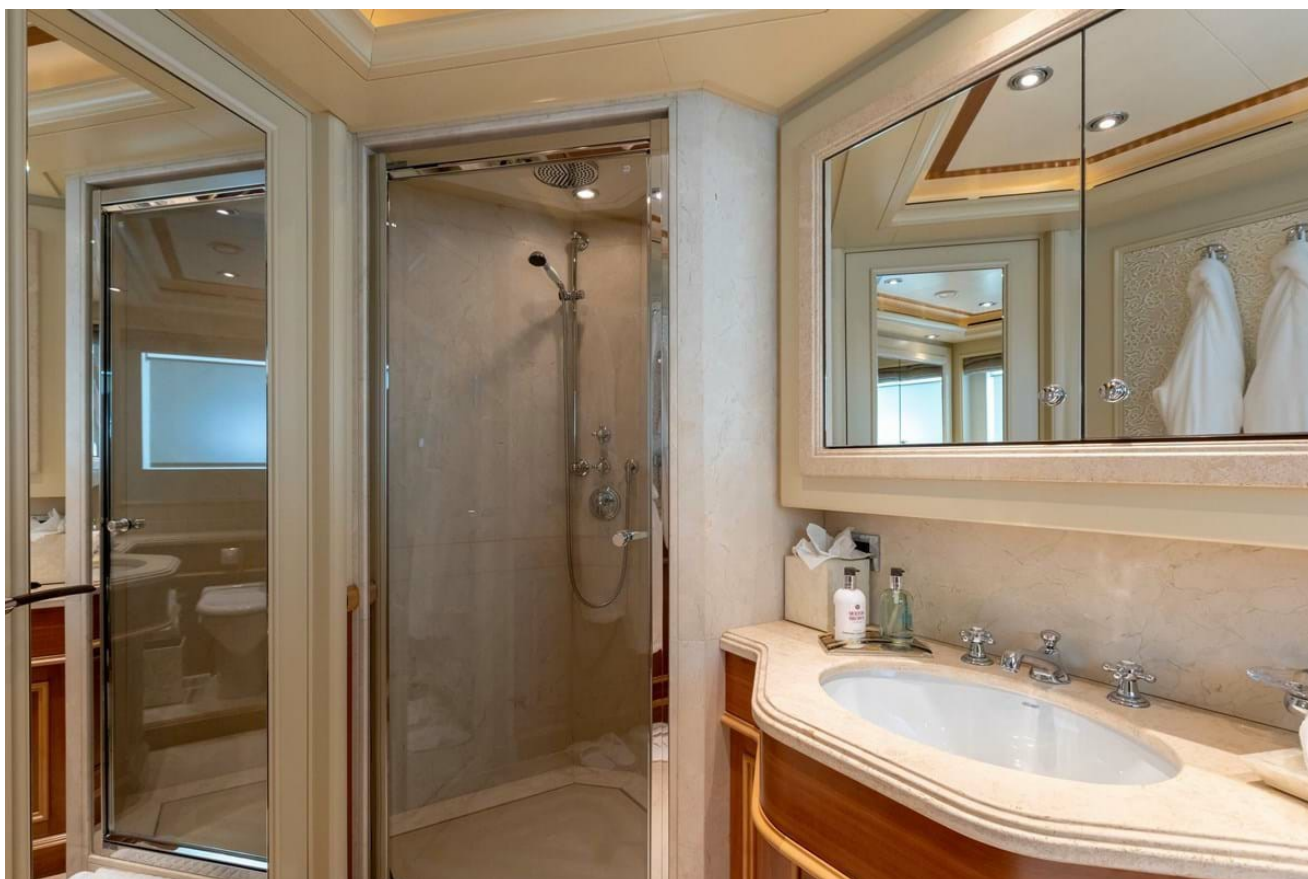
Guest bathrooms en suite