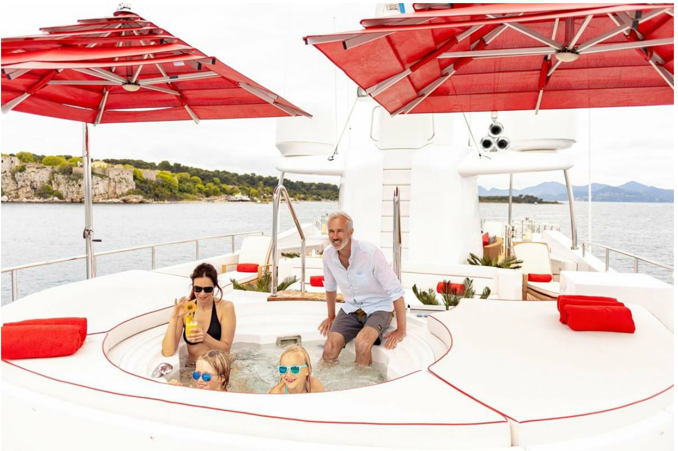
Sun deck jacuzzi