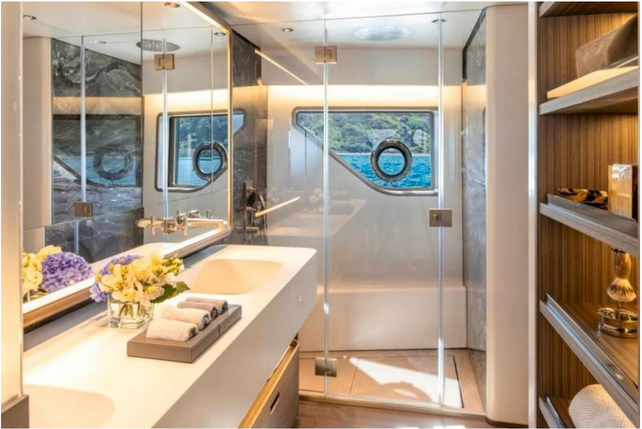
Master suite shower room