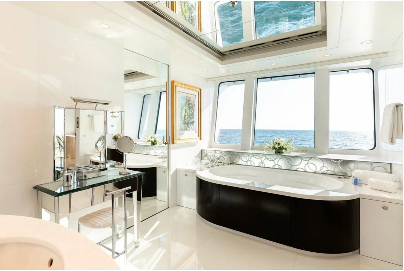
Master her bathroom en suite