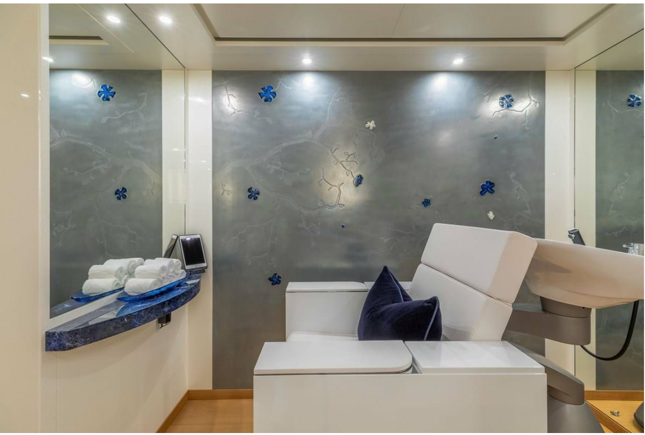
New wellness area