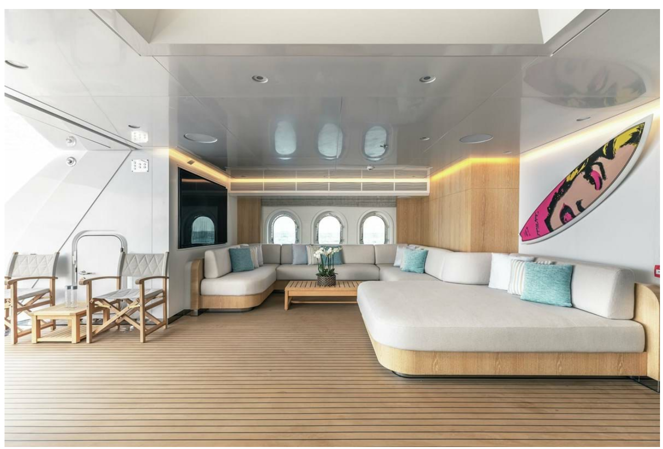
A fabulous new 66sqm (710sqft) beach club