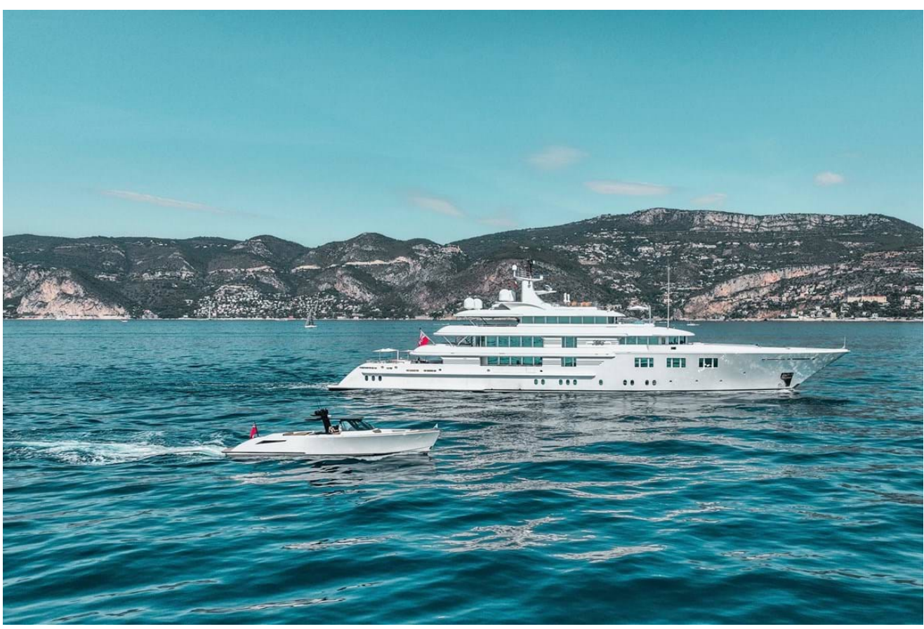
LADY E & CHE SARA SARA