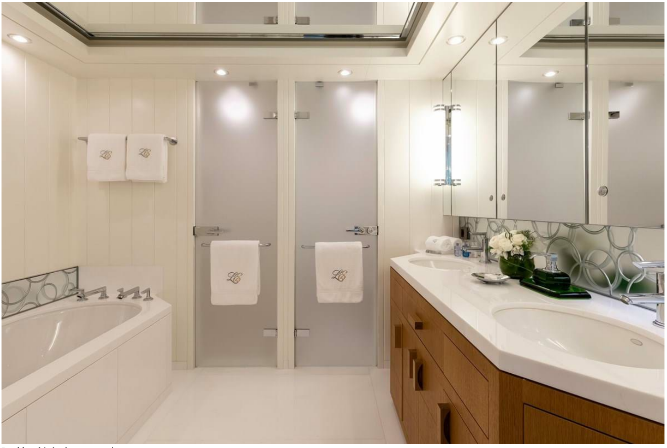
Double cabin bathroom en suite