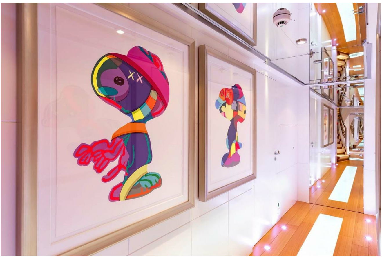
Lower deck cabin's corridor