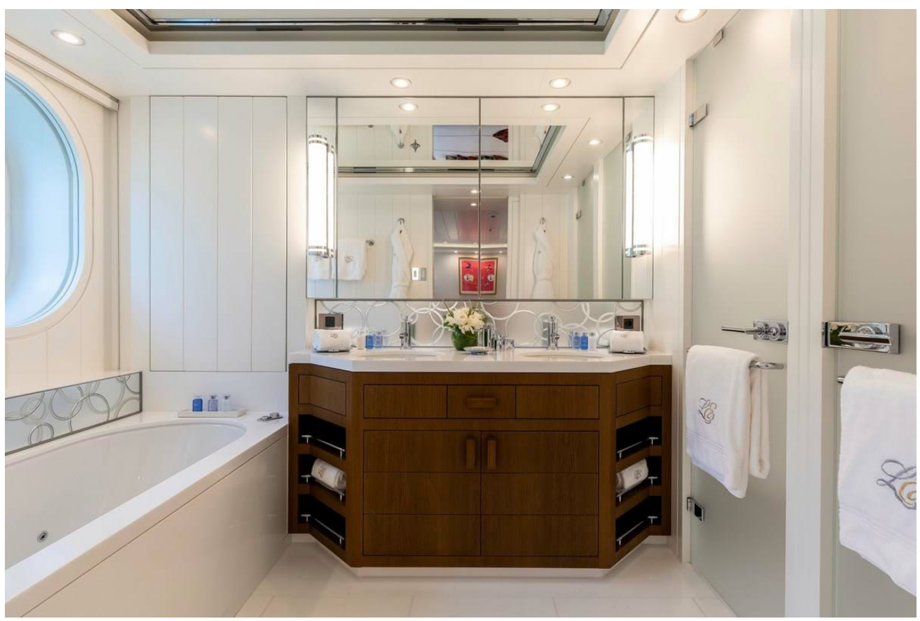
Double cabin bathroom en suite