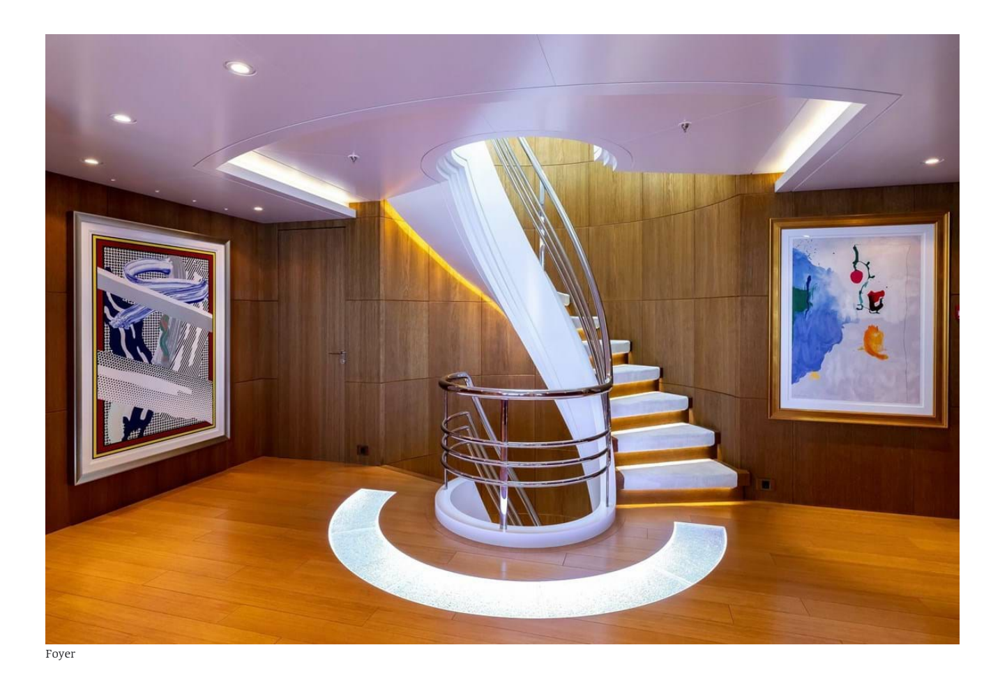
Bridge deck lounge