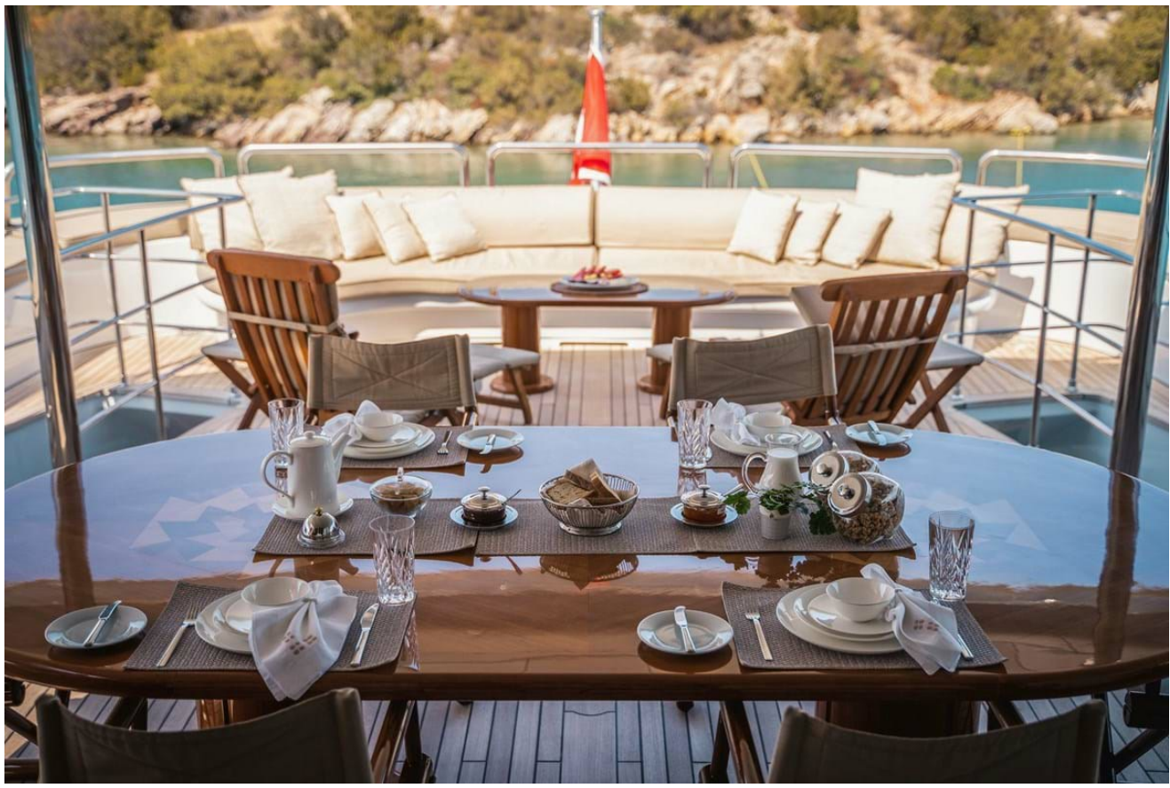
Upper deck aft dining