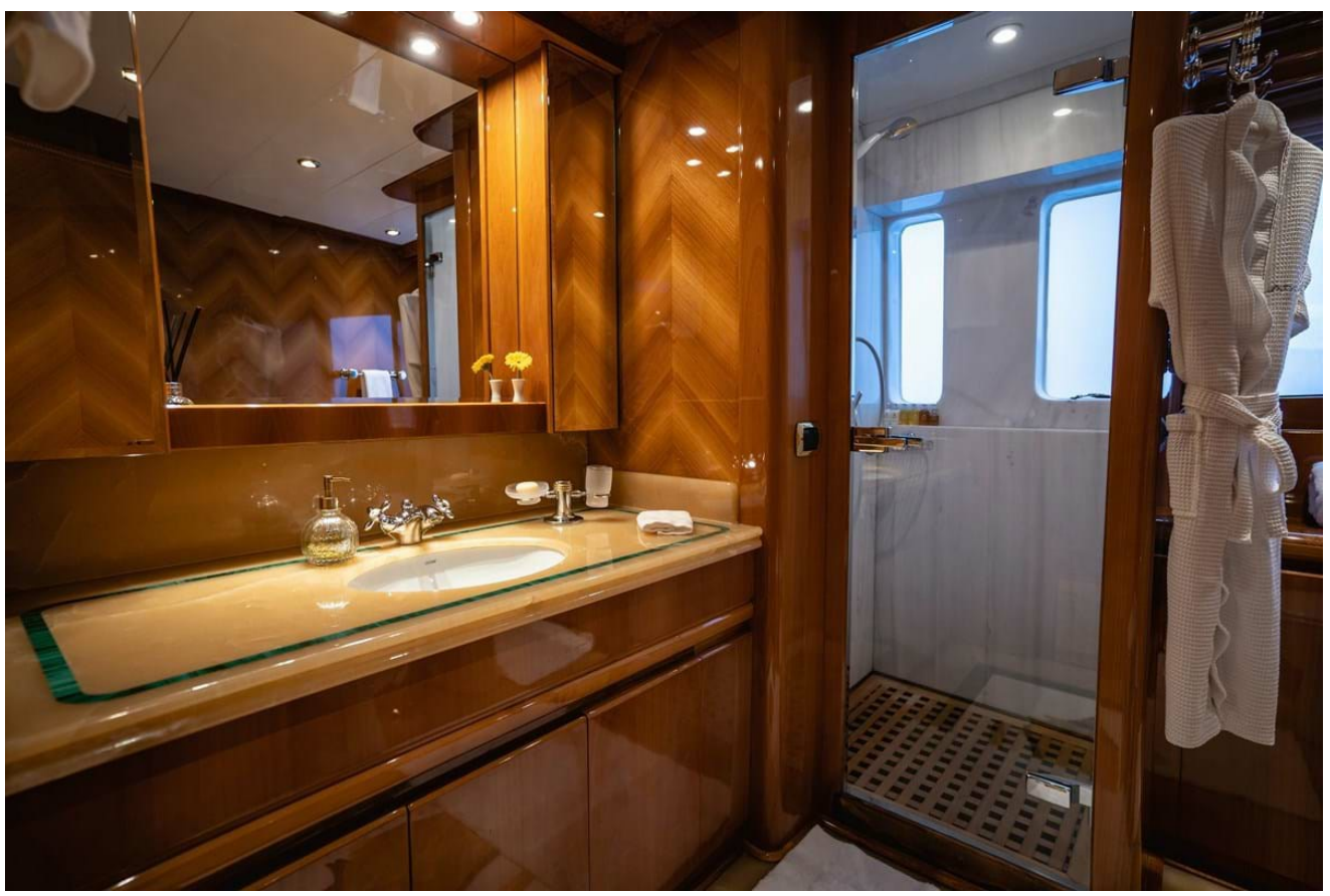
Owner's bathroom - His