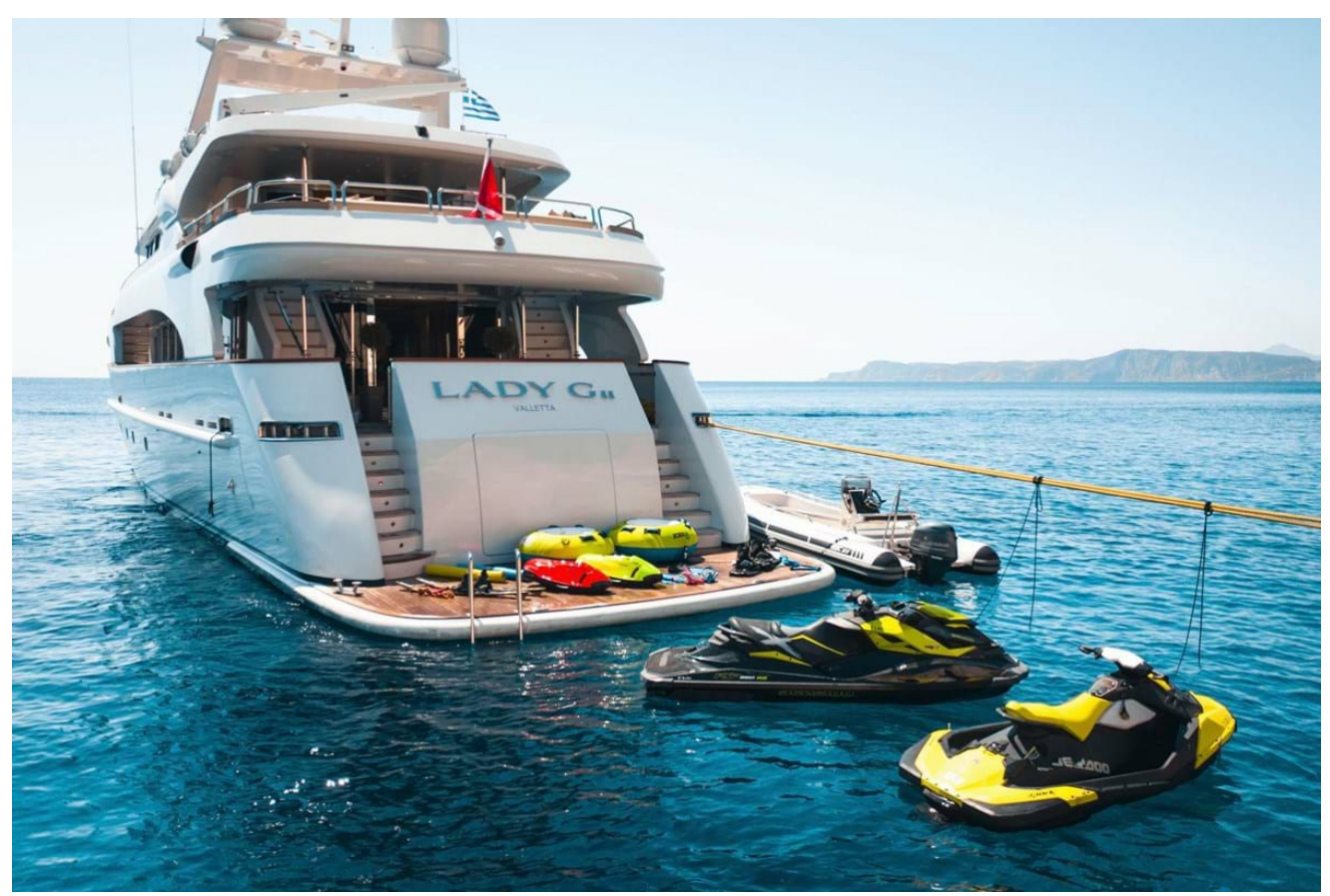
Water toys and tender