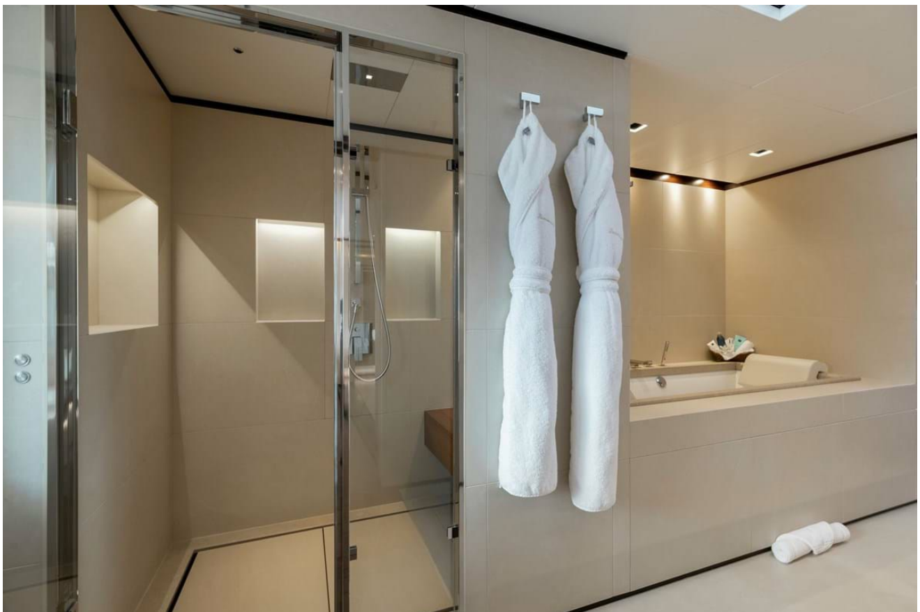
Master cabin bathroom en suite with separated shower