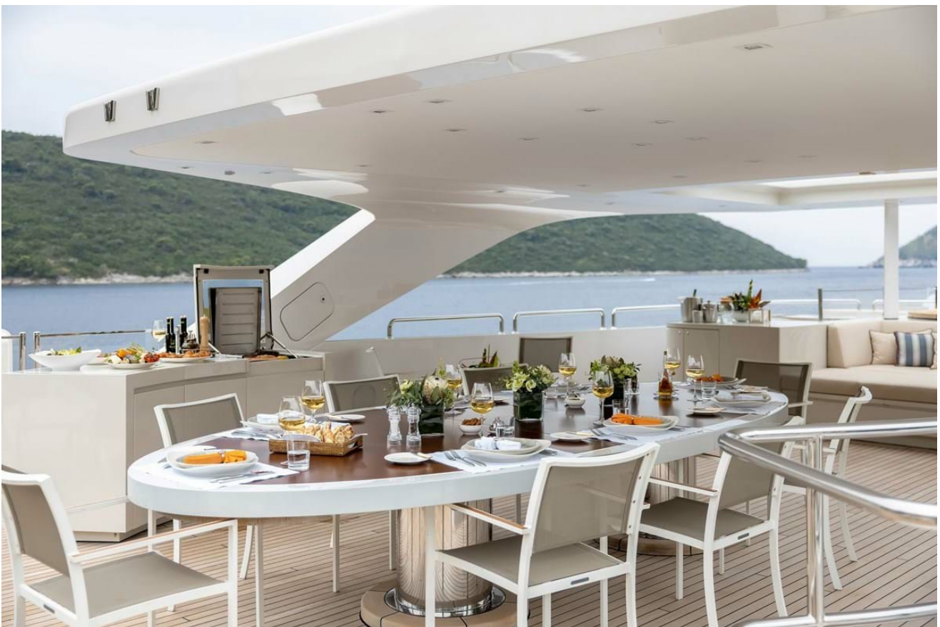
Sun deck dining