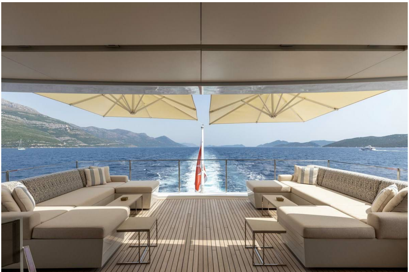
Bridge deck aft