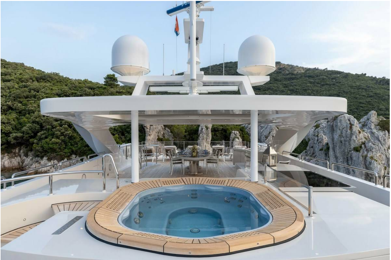
Sun deck jacuzzi and dining area