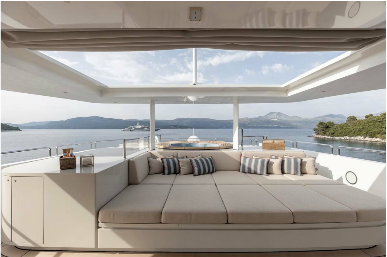
Sun deck sunpads and jacuzzi