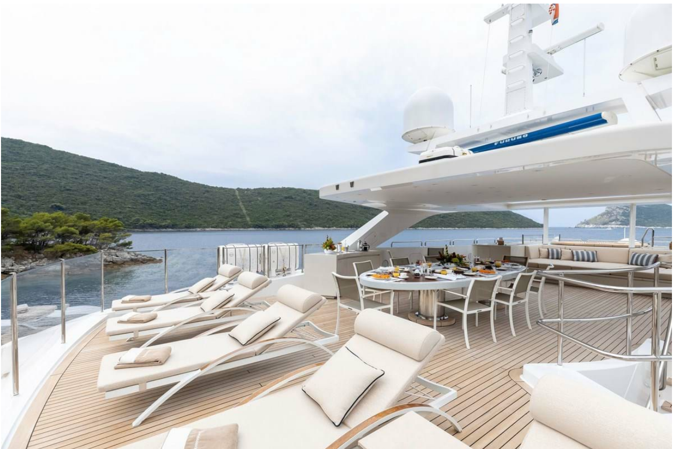
Sun deck sunloungers and dining