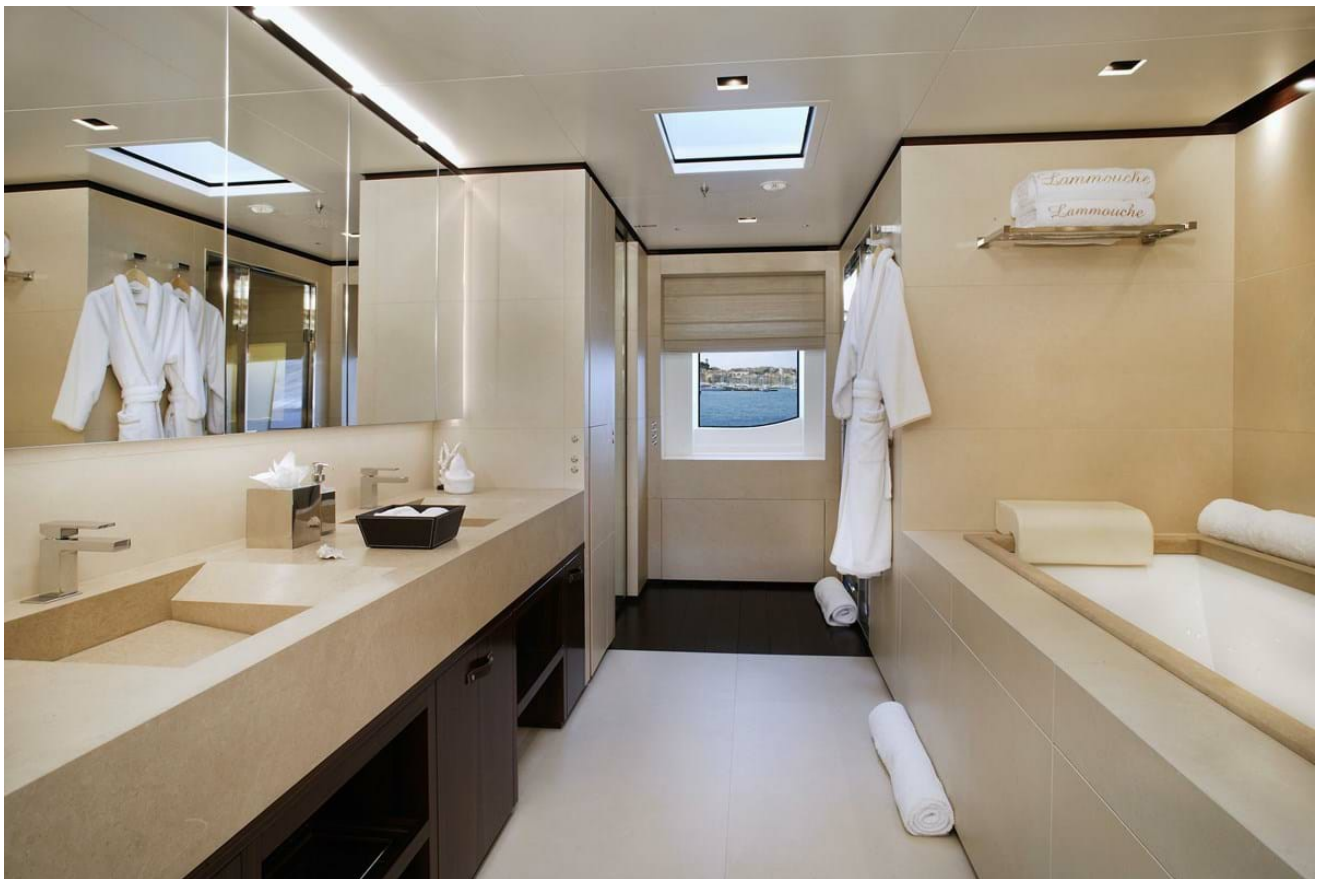
Owner's en suite