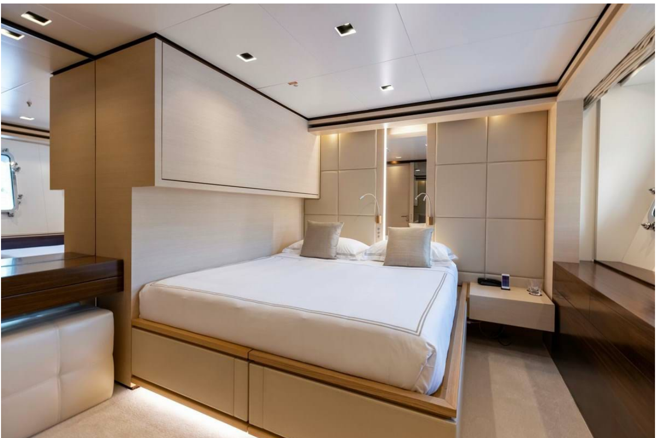
Lower deck twin cabin convertible into double cabin