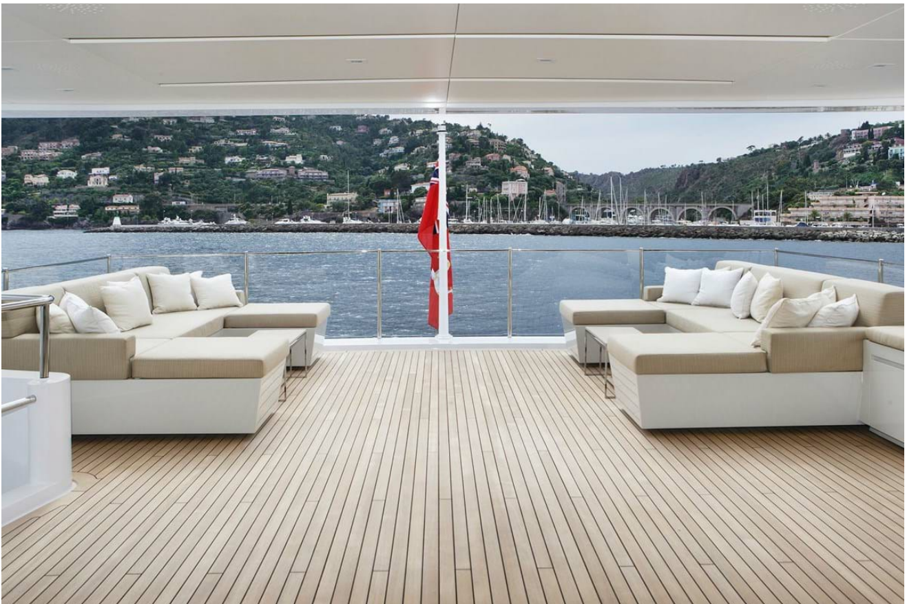
Bridge deck aft