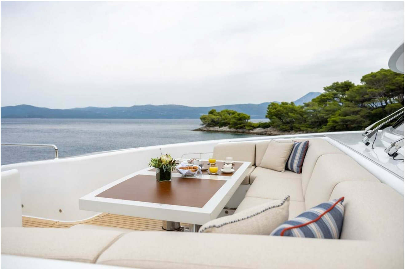
Foredeck sitting area