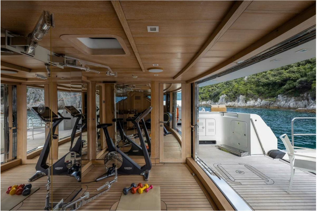
Beach club and gym equipment