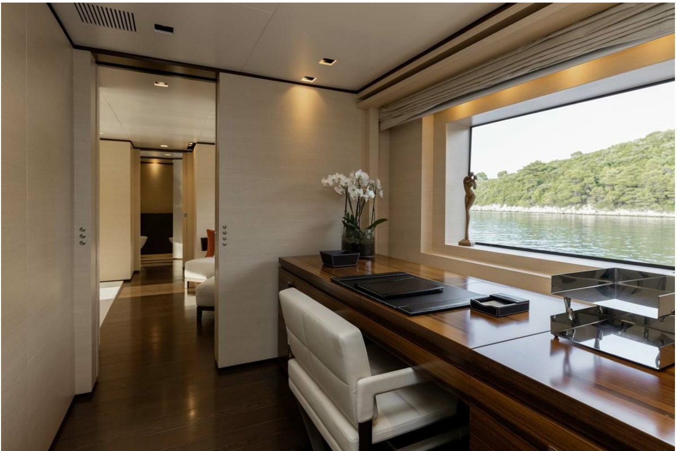
Master cabin office