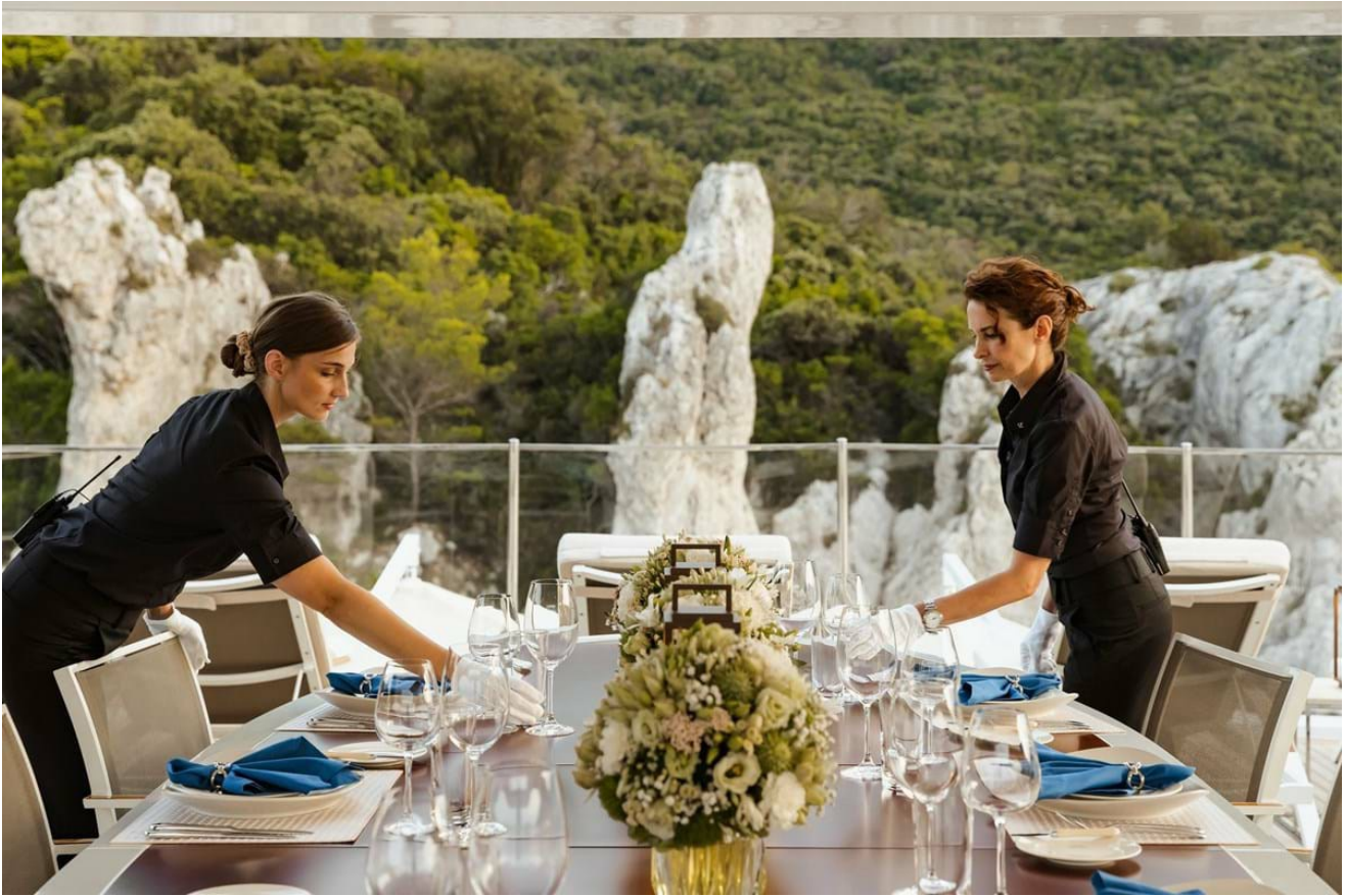
Sun deck dining