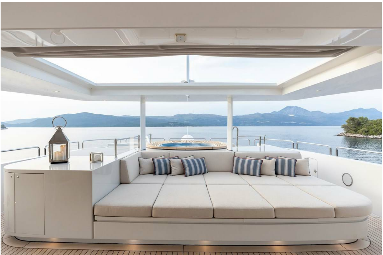
Sun deck sunpads and jacuzzi