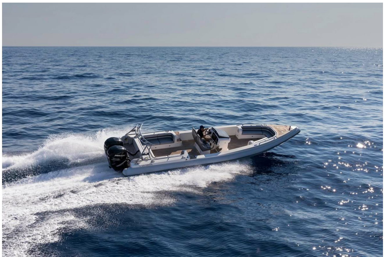
11m Wahoo tender