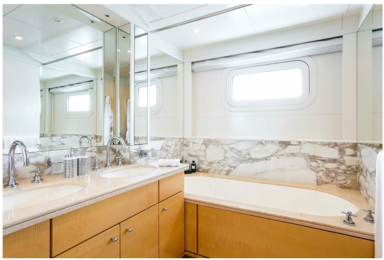
Guest double cabin en suite