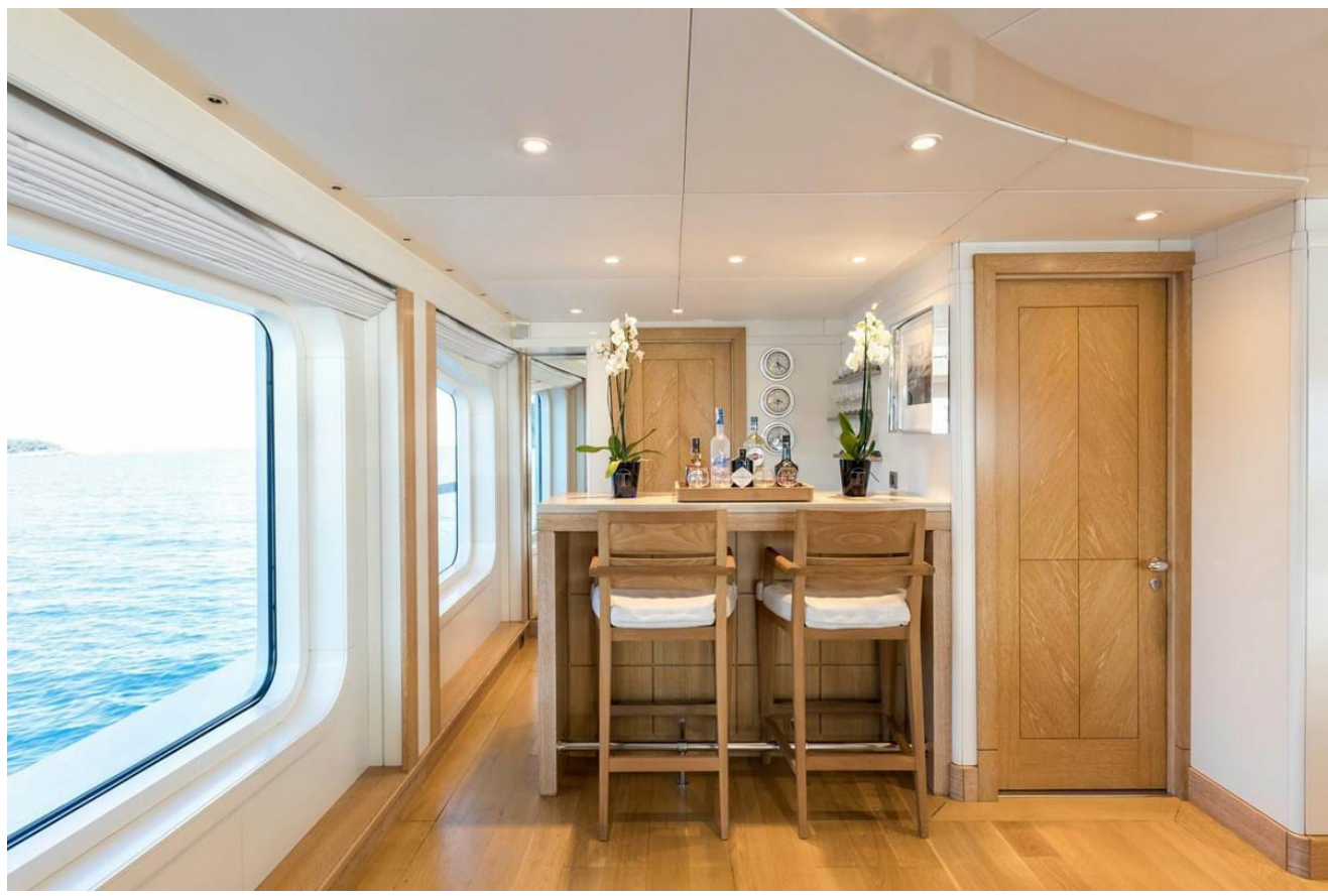
Bridge deck bar