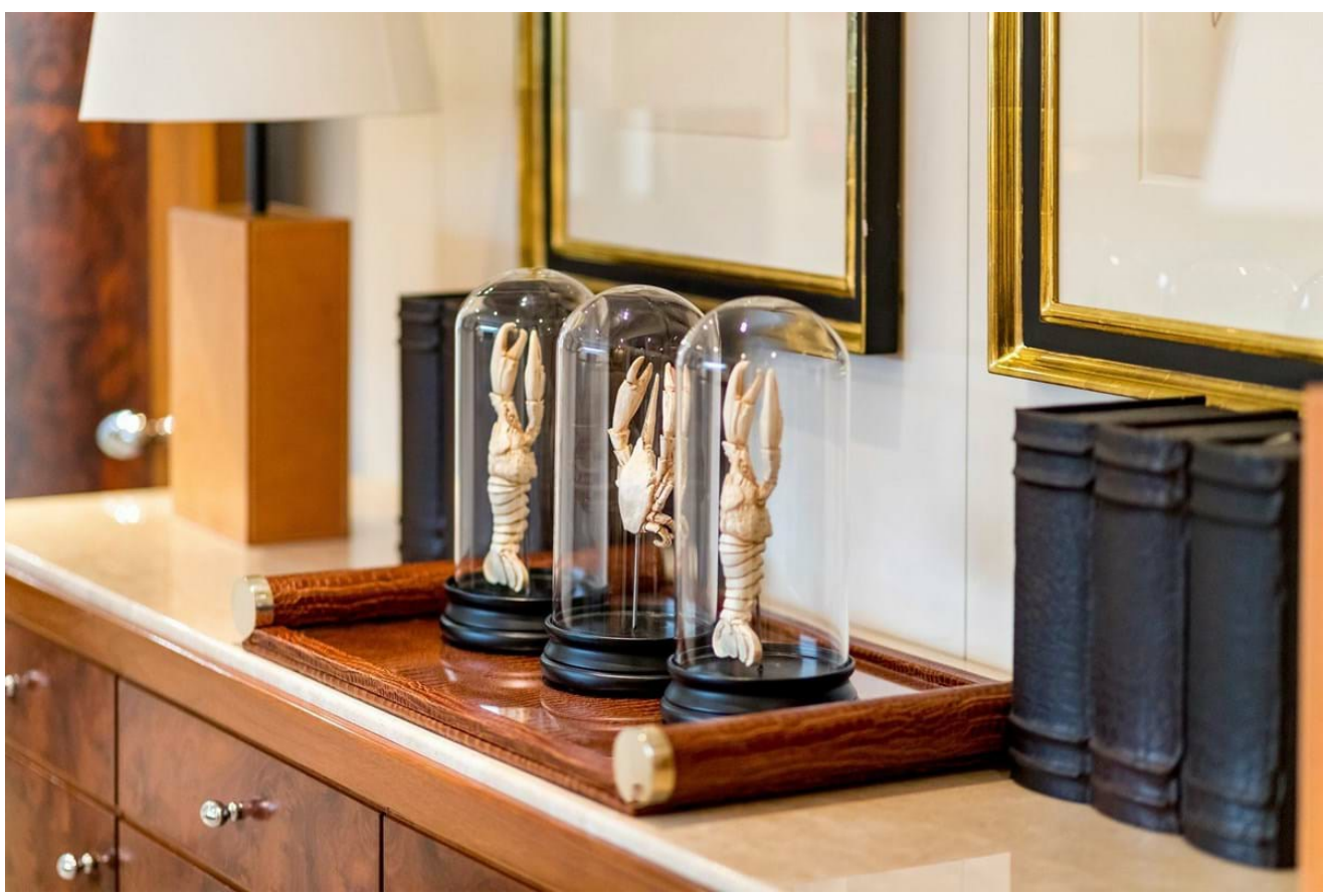
Master cabin details