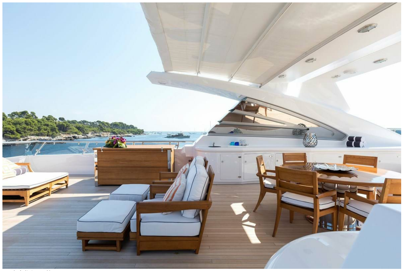
Sun deck dining and lounge area