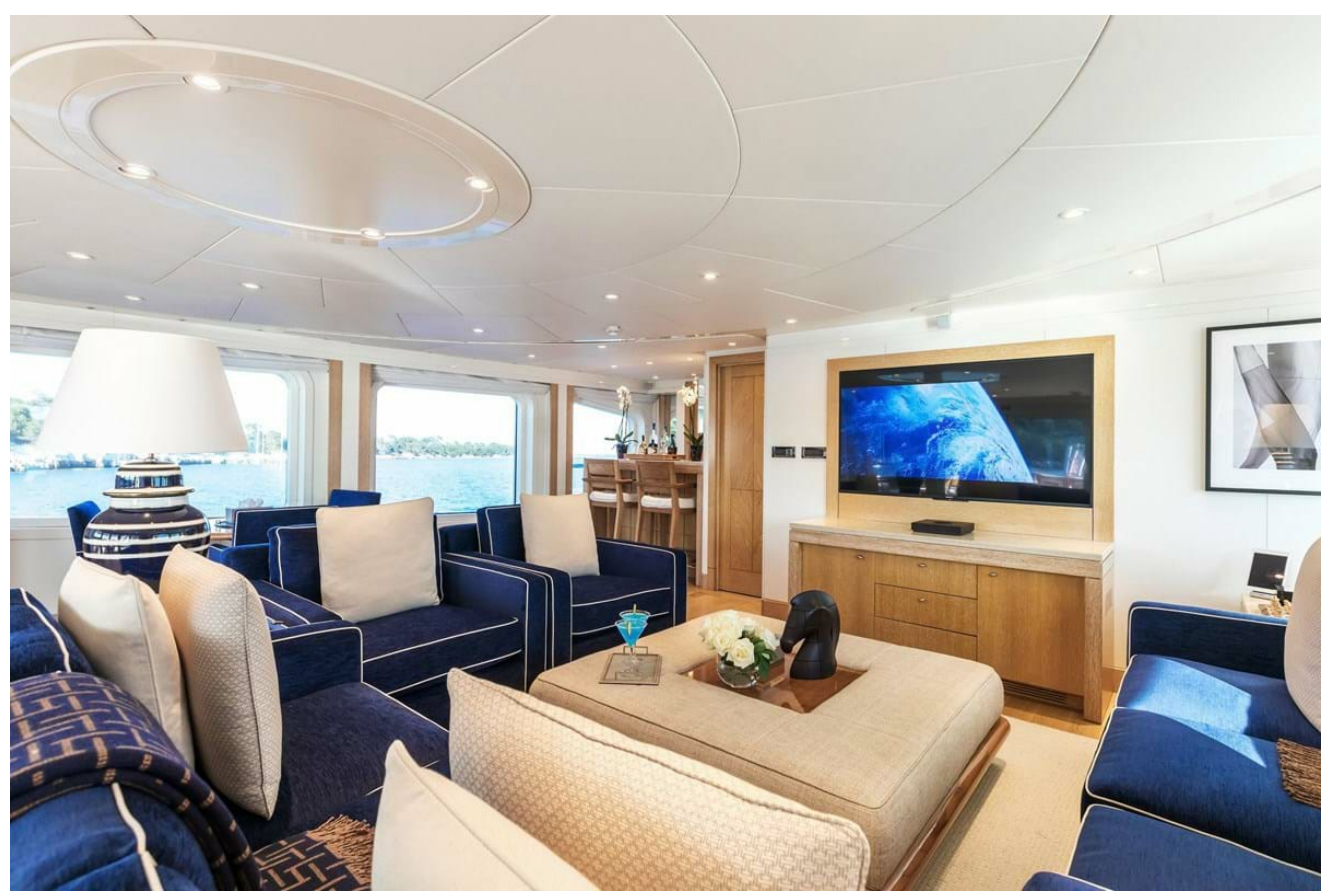
Bridge deck lounge