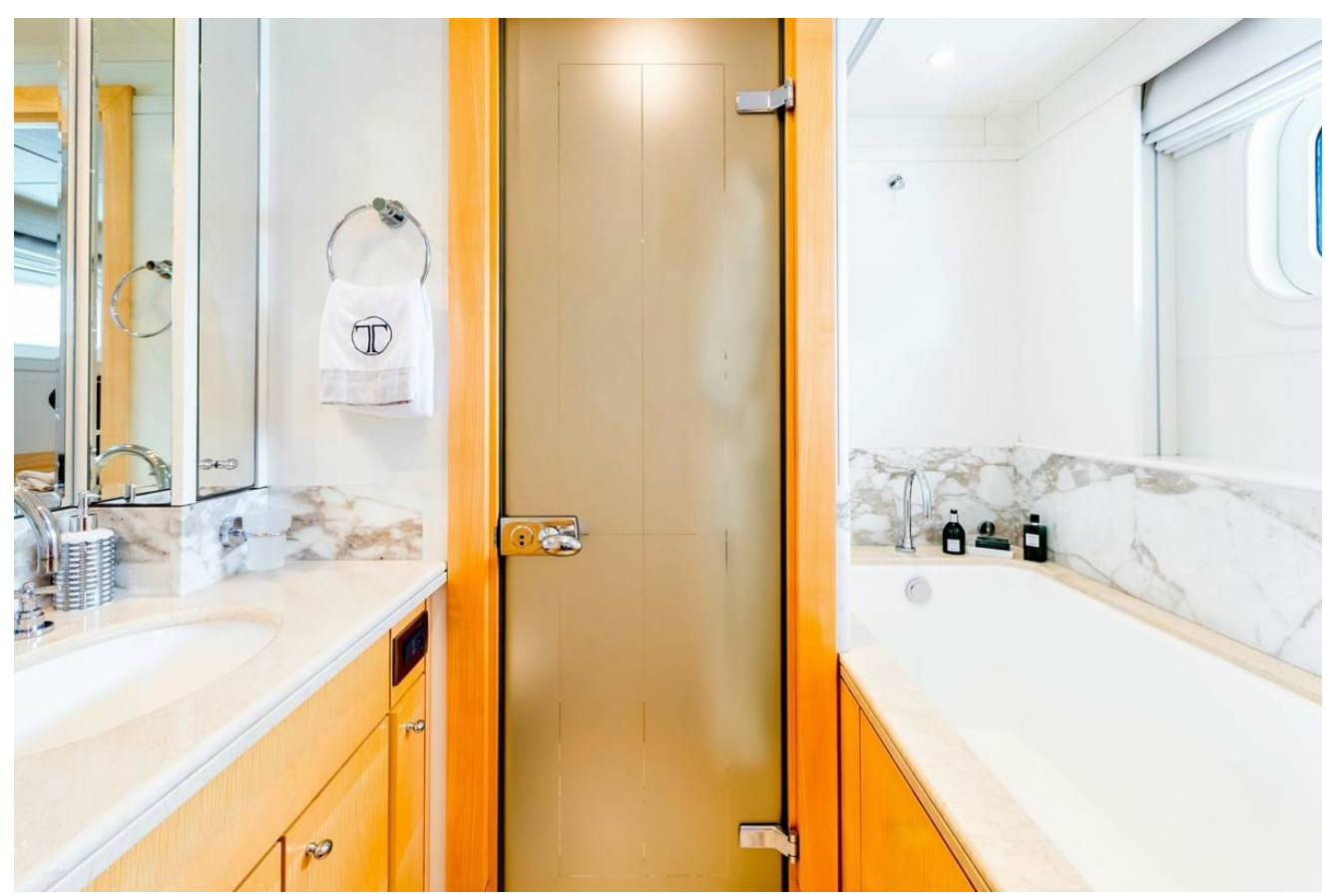
Guest triple cabin en suite