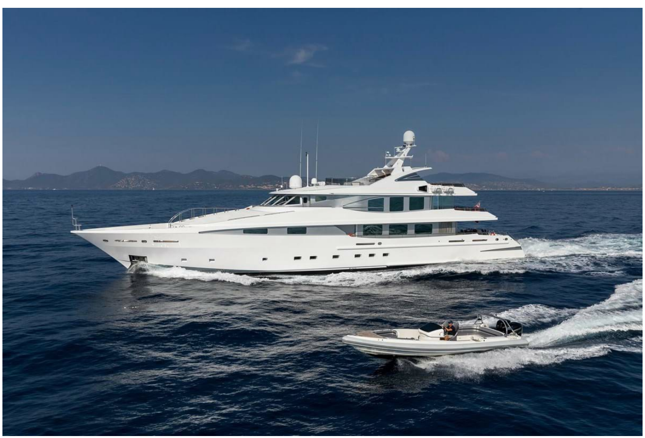
Running with tender