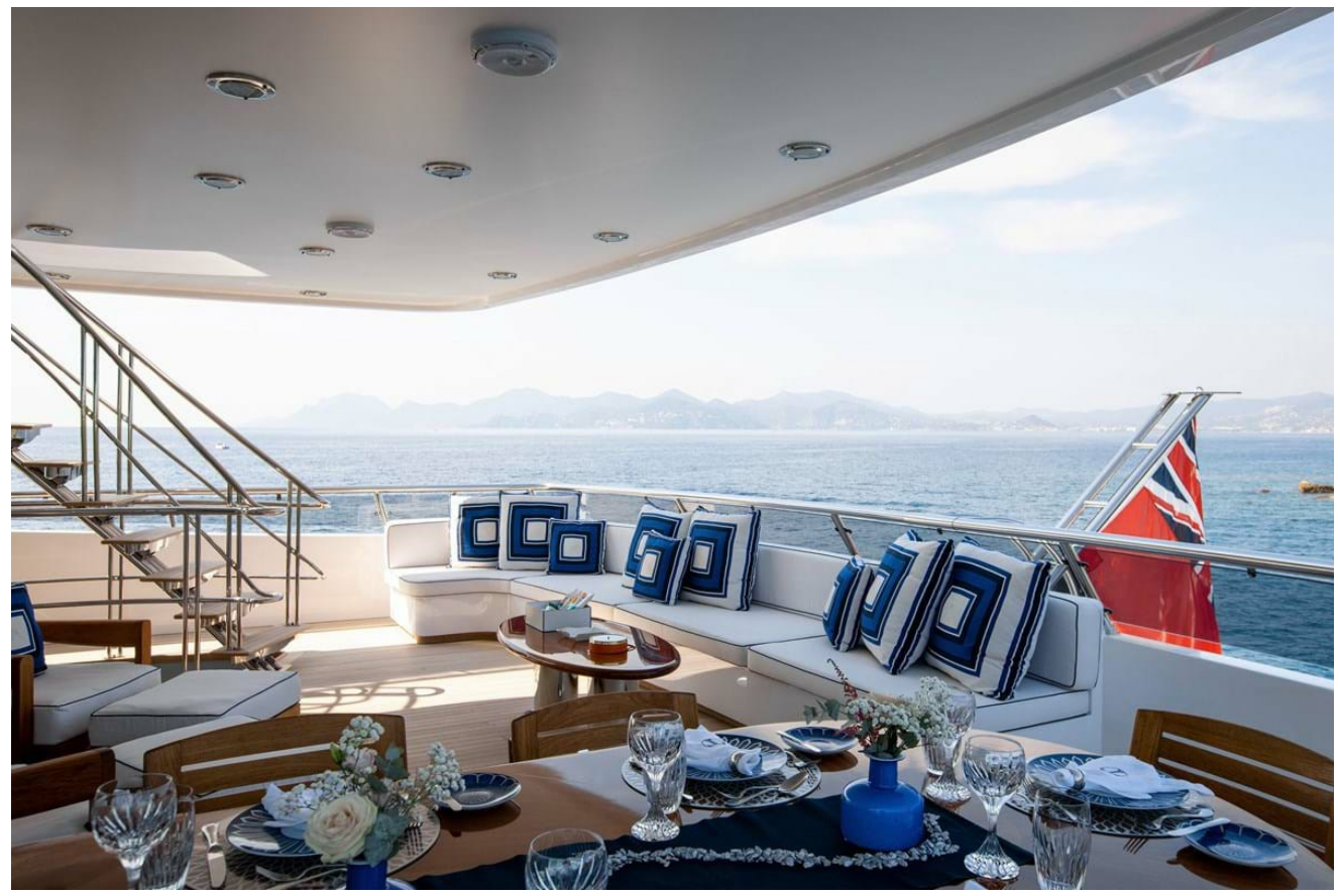
Bridge deck aft