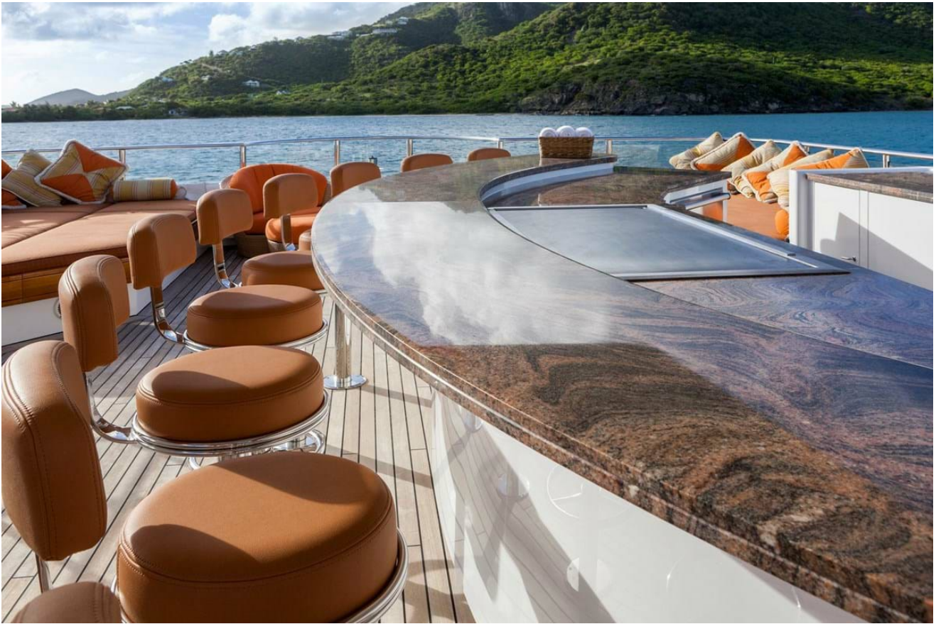
Sun deck teppanyaki bar