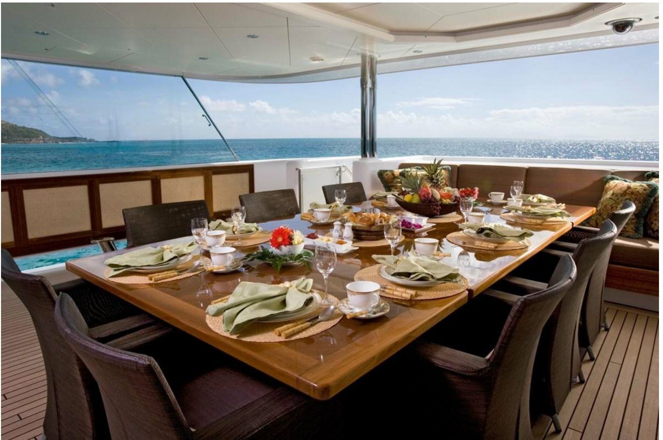
Main deck aft dining area