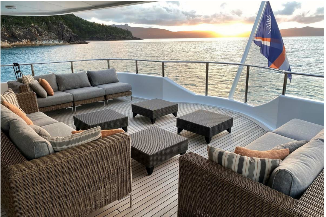
Bridge deck aft seating area