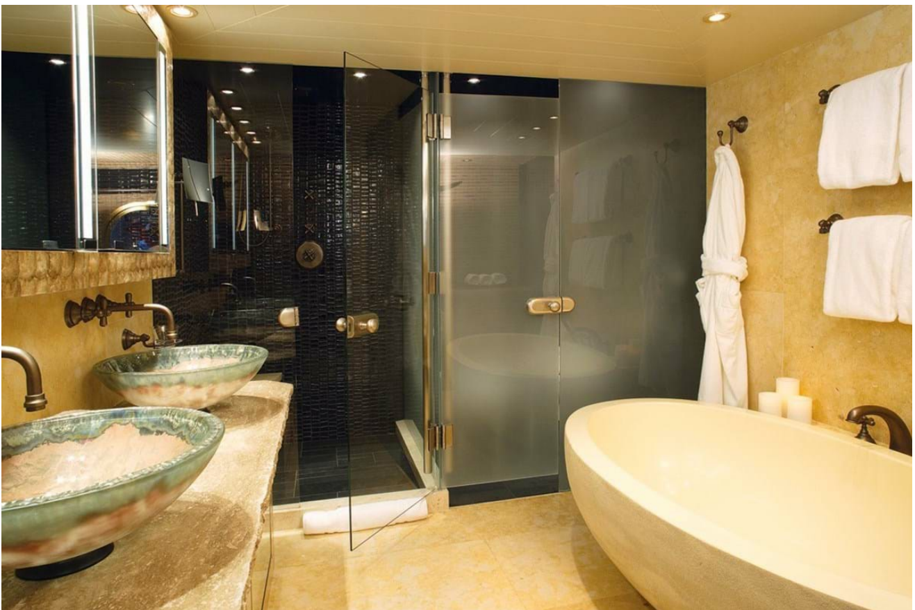
Master bathroom en suite