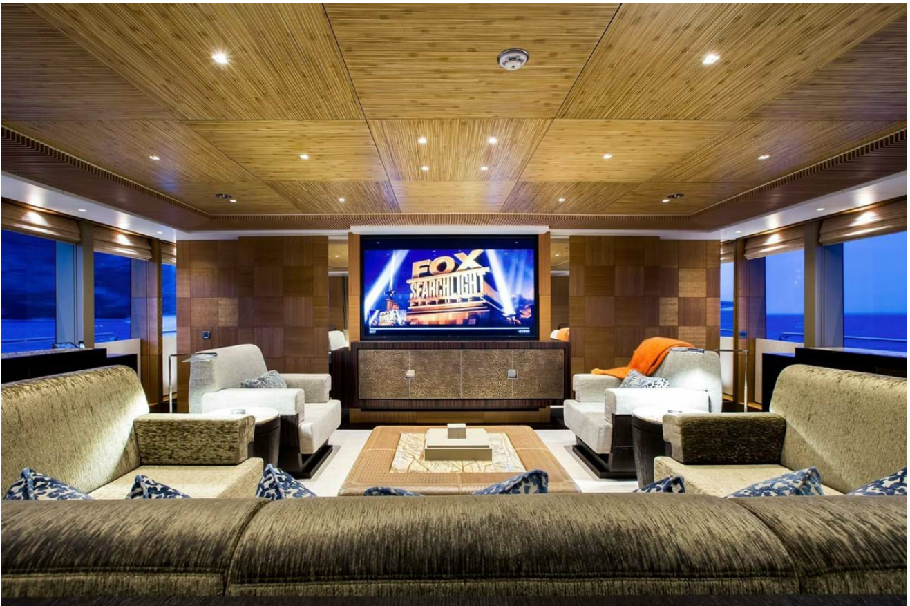
Upper deck lounge