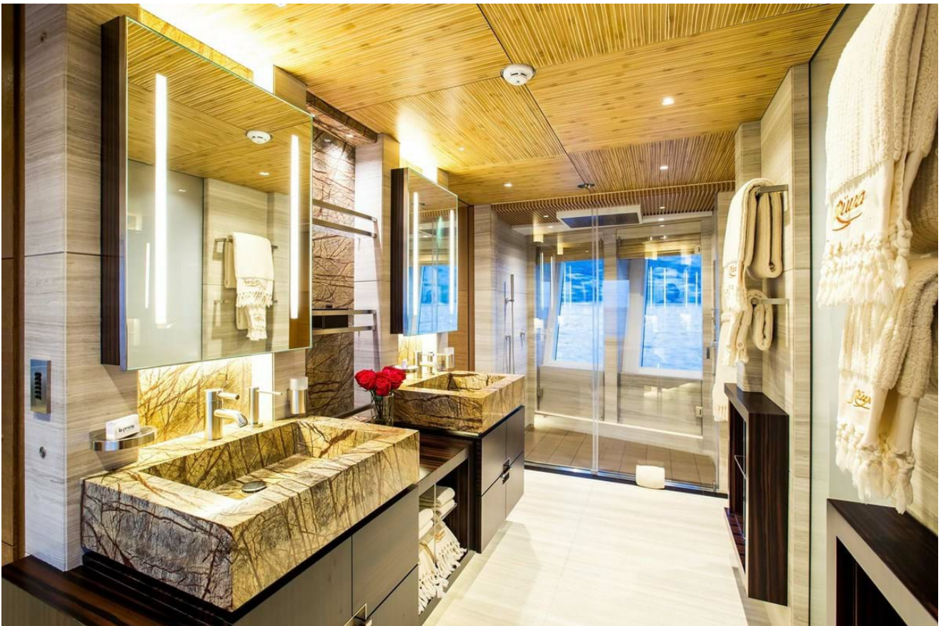
Master cabin en suite bathroom