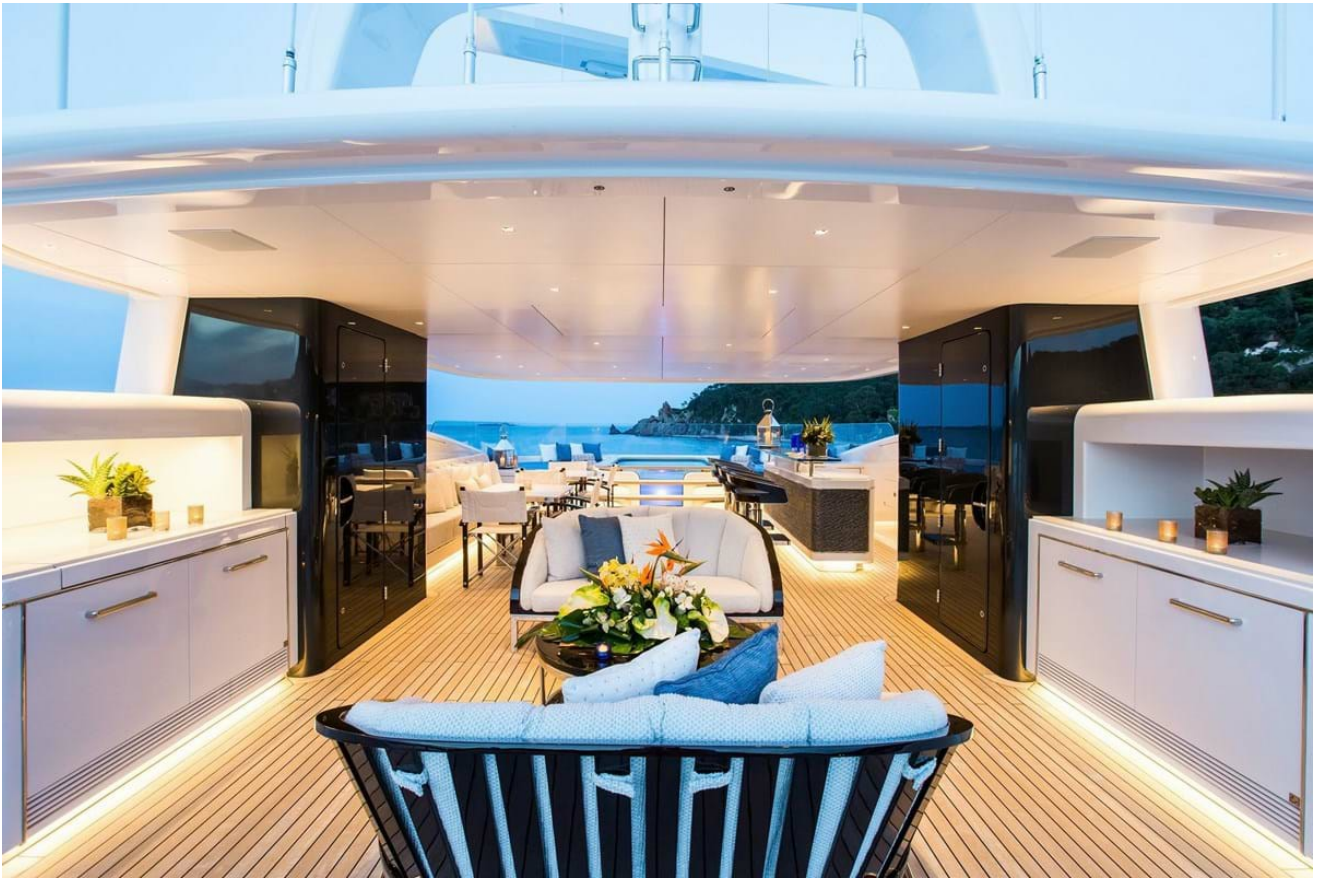
Sun deck lounge