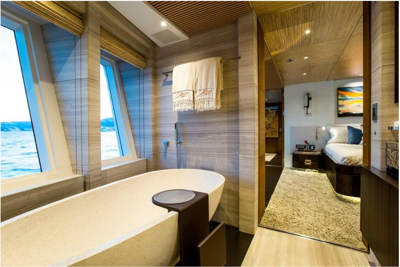
Master cabin en suite bathroom