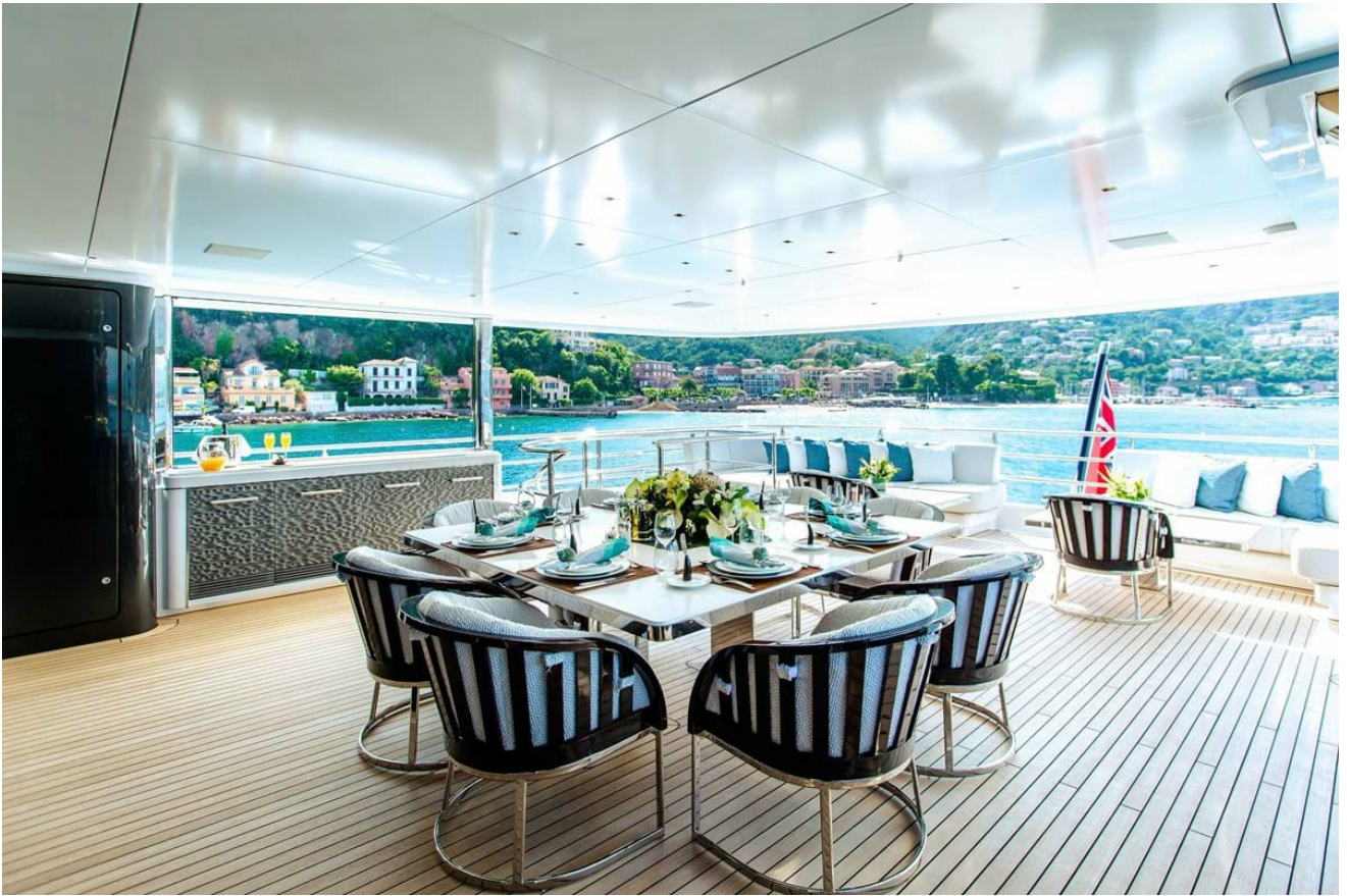
Main deck outdoor dining