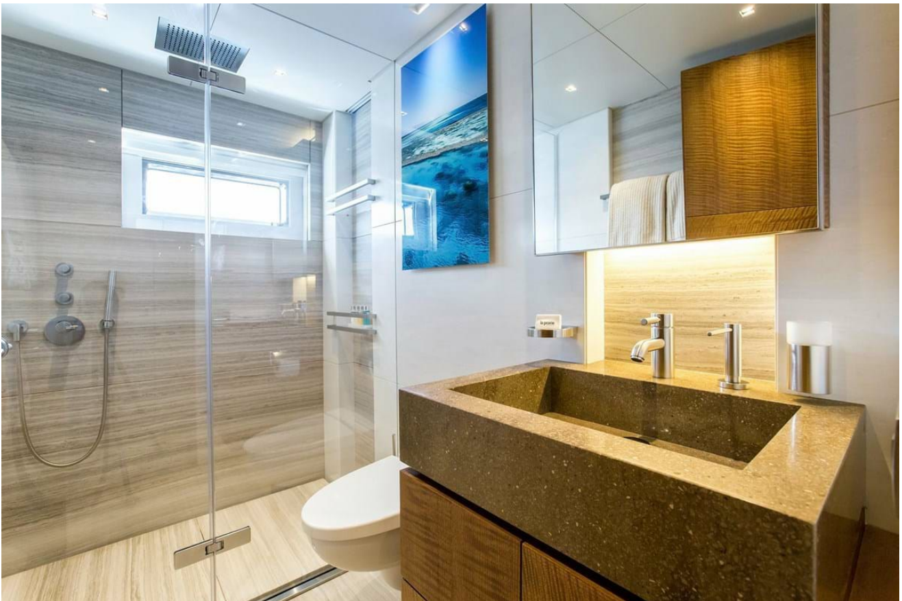
Double cabin en suite bathroom