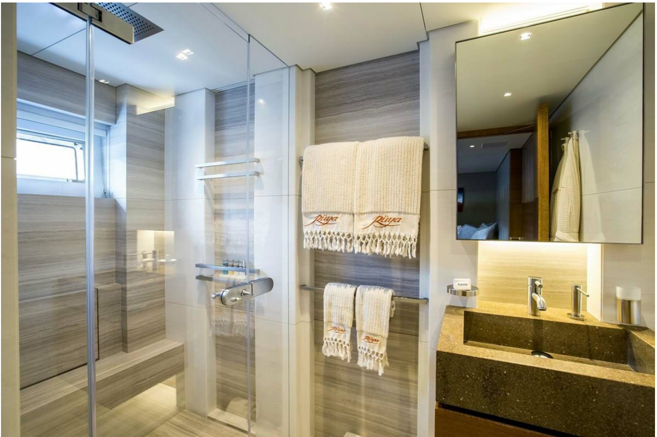
Twin cabin en suite bathroom