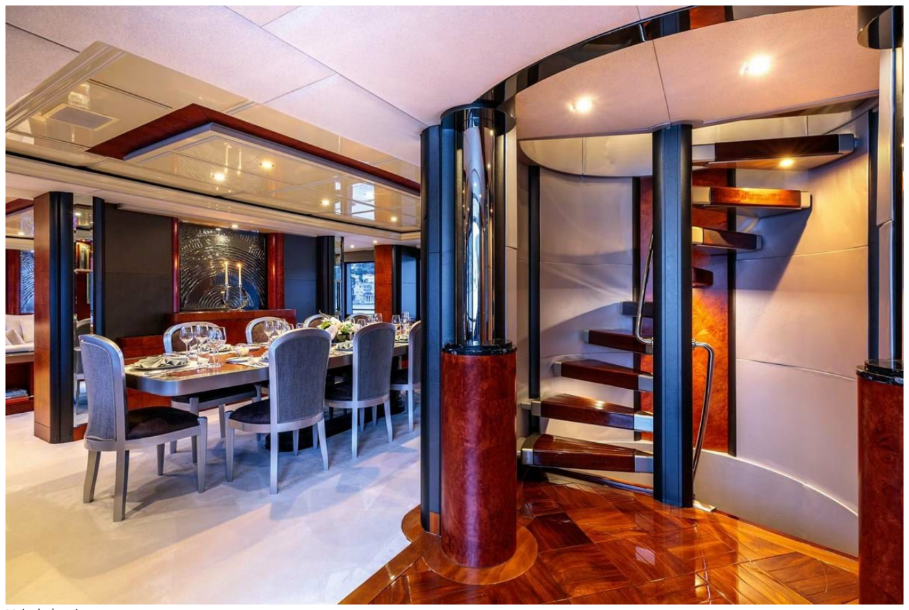
Main deck atrium