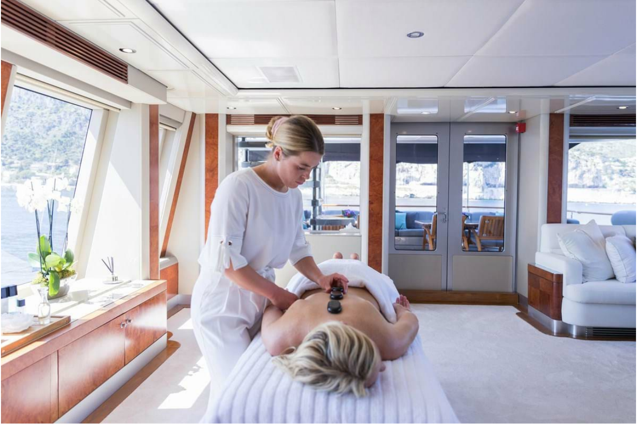
On board spa treatments