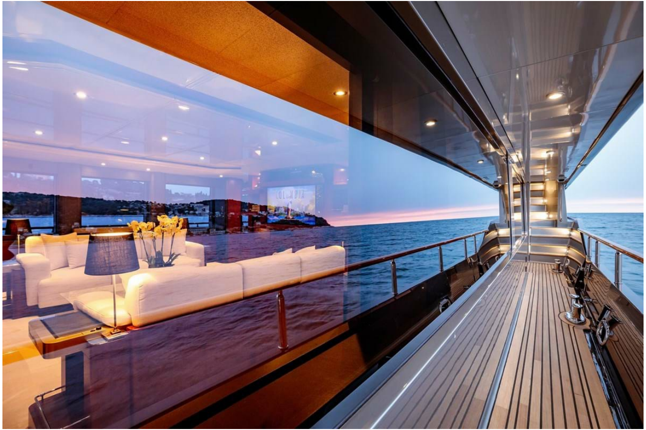
Main deck starboard side