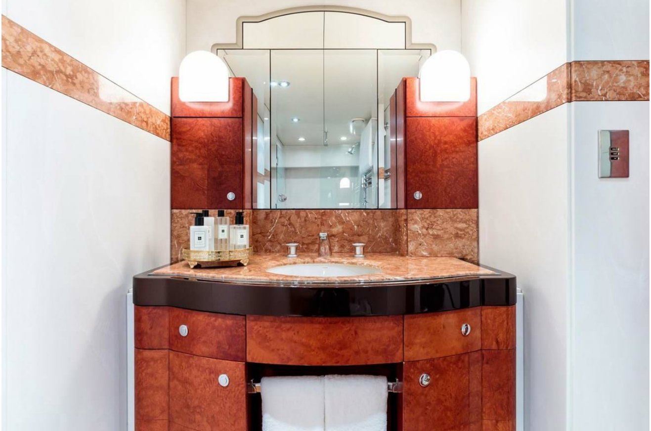
Guest shower room