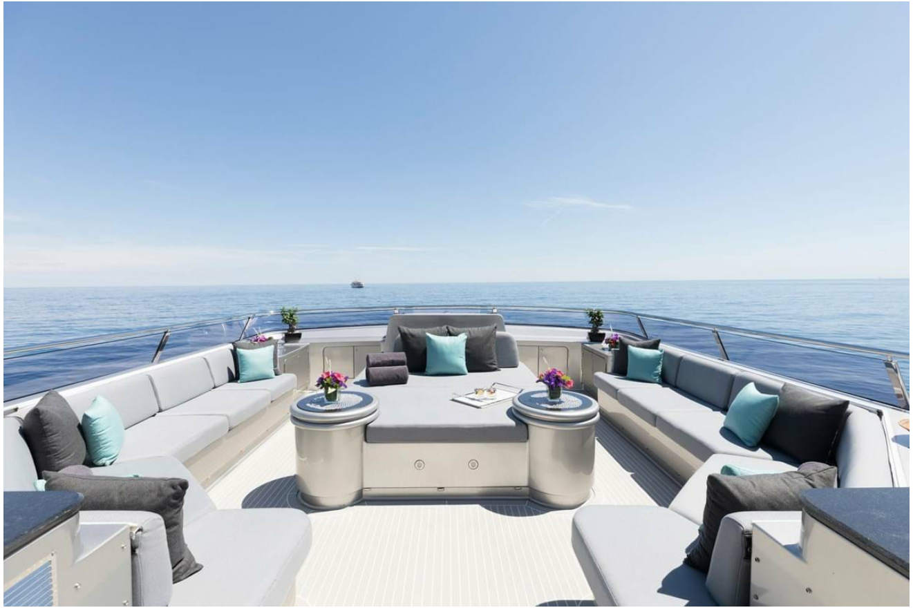
Sun deck sun pads