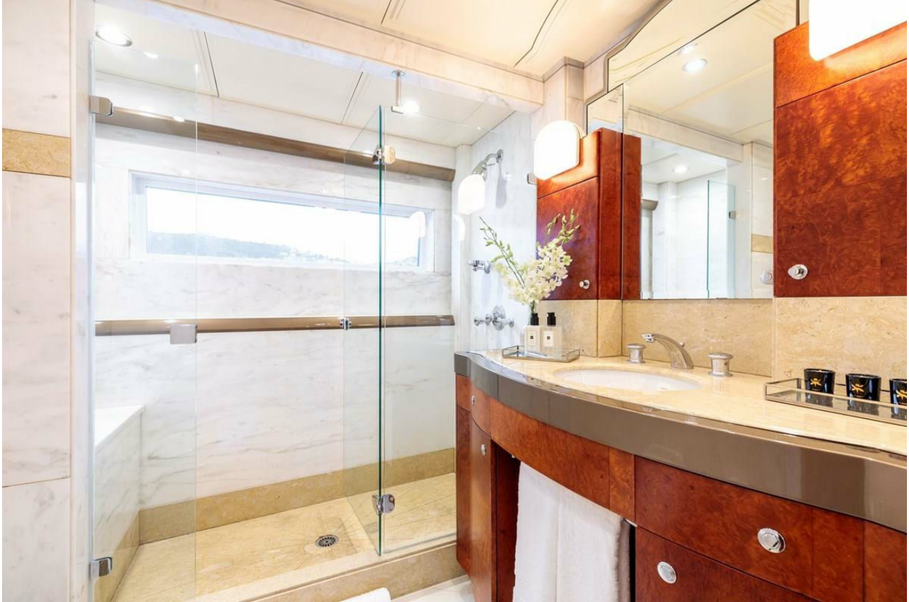
Master shower room