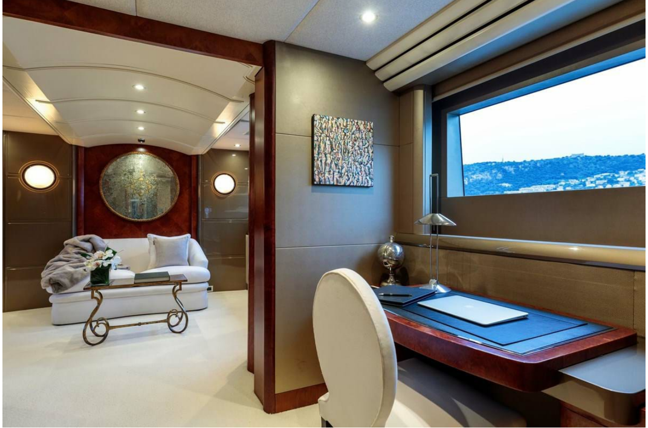
Master suite office