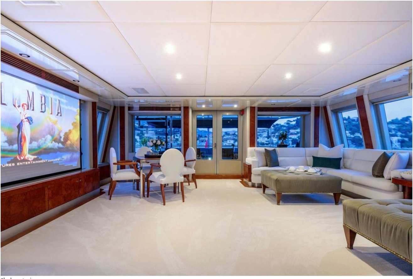
Sky lounge cinema screen