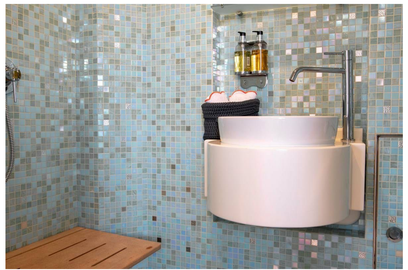
Day head, Steam room, Shower