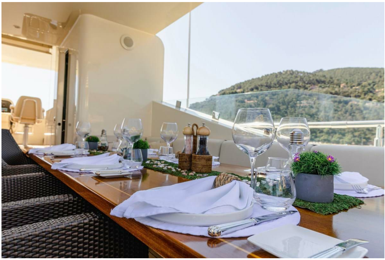
Outdoor dining details