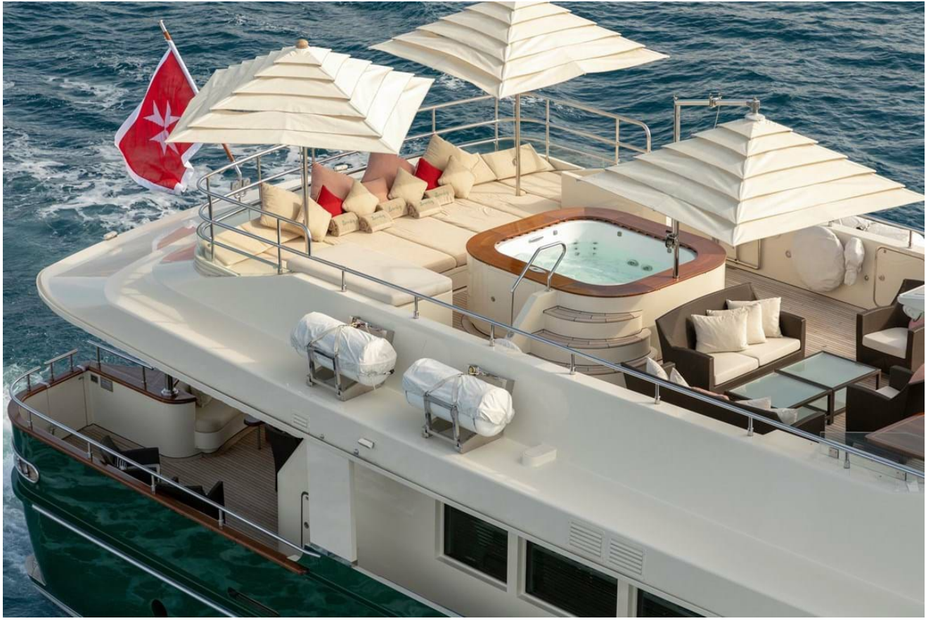
Sun deck aft jacuzzi