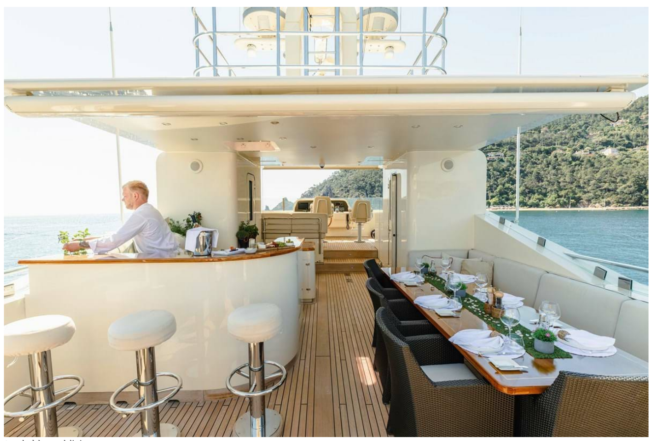
Sun deck bar and dining