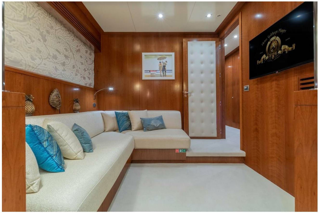
Master suite lounge