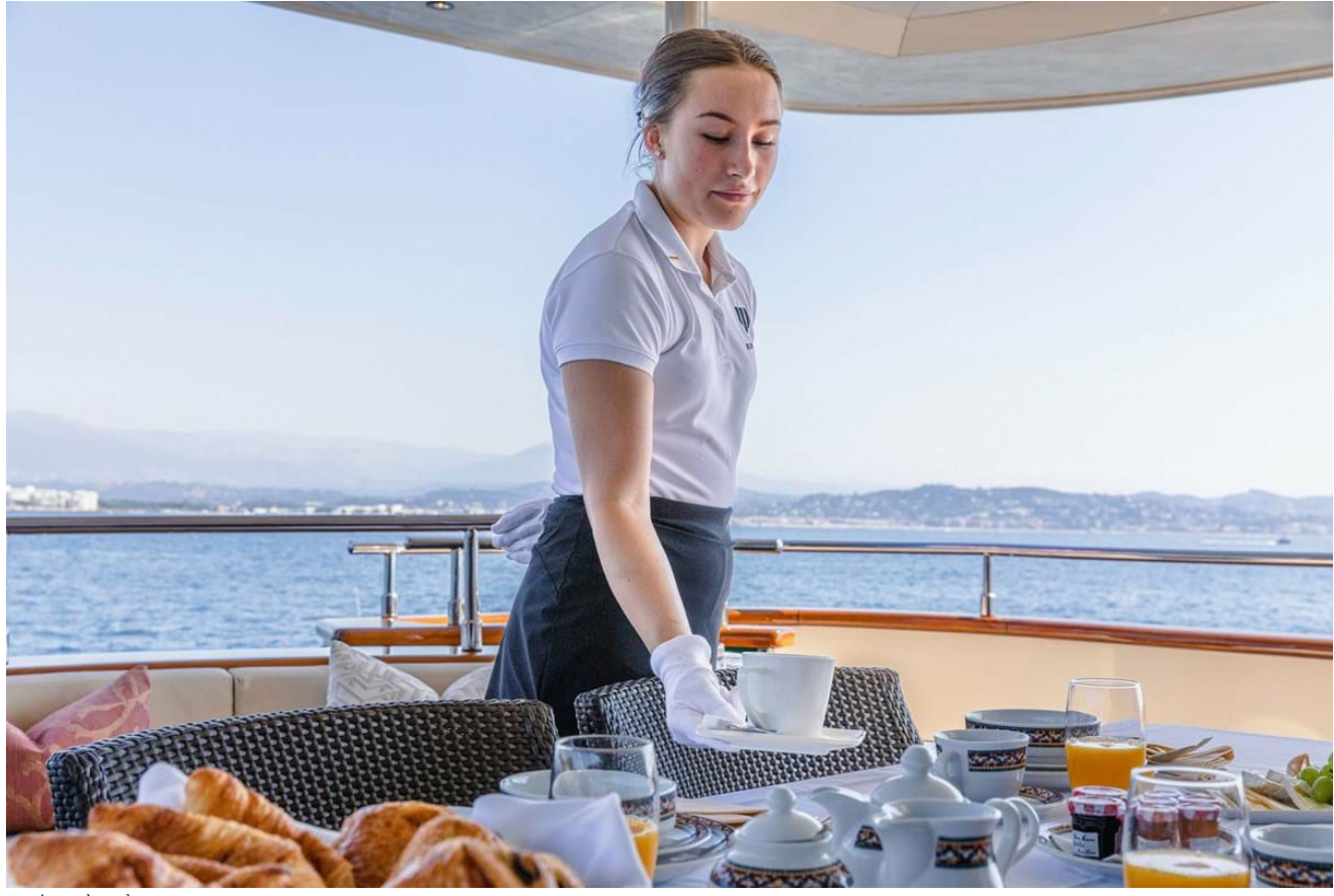
Service on board