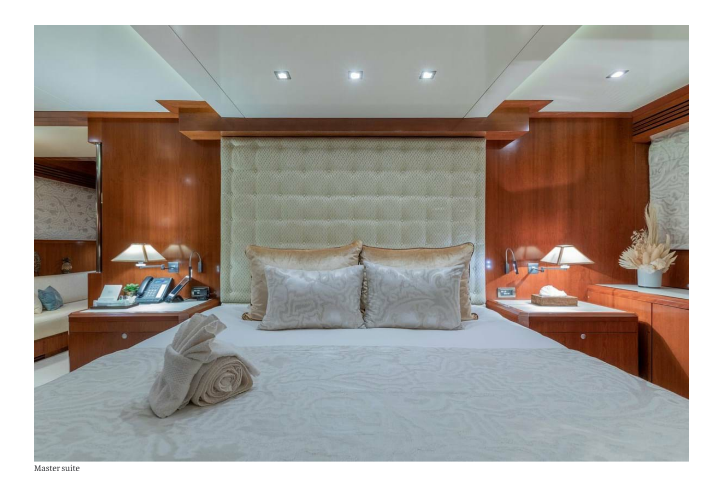
Master suite & amp; private lounge