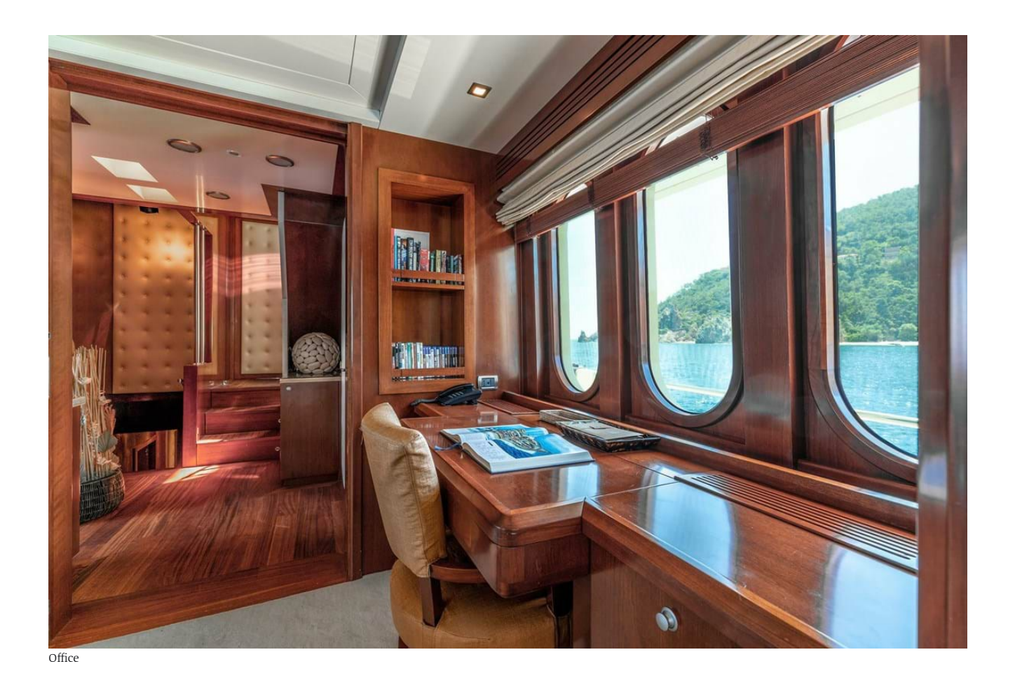
Master en suite bathroom & amp; shower room