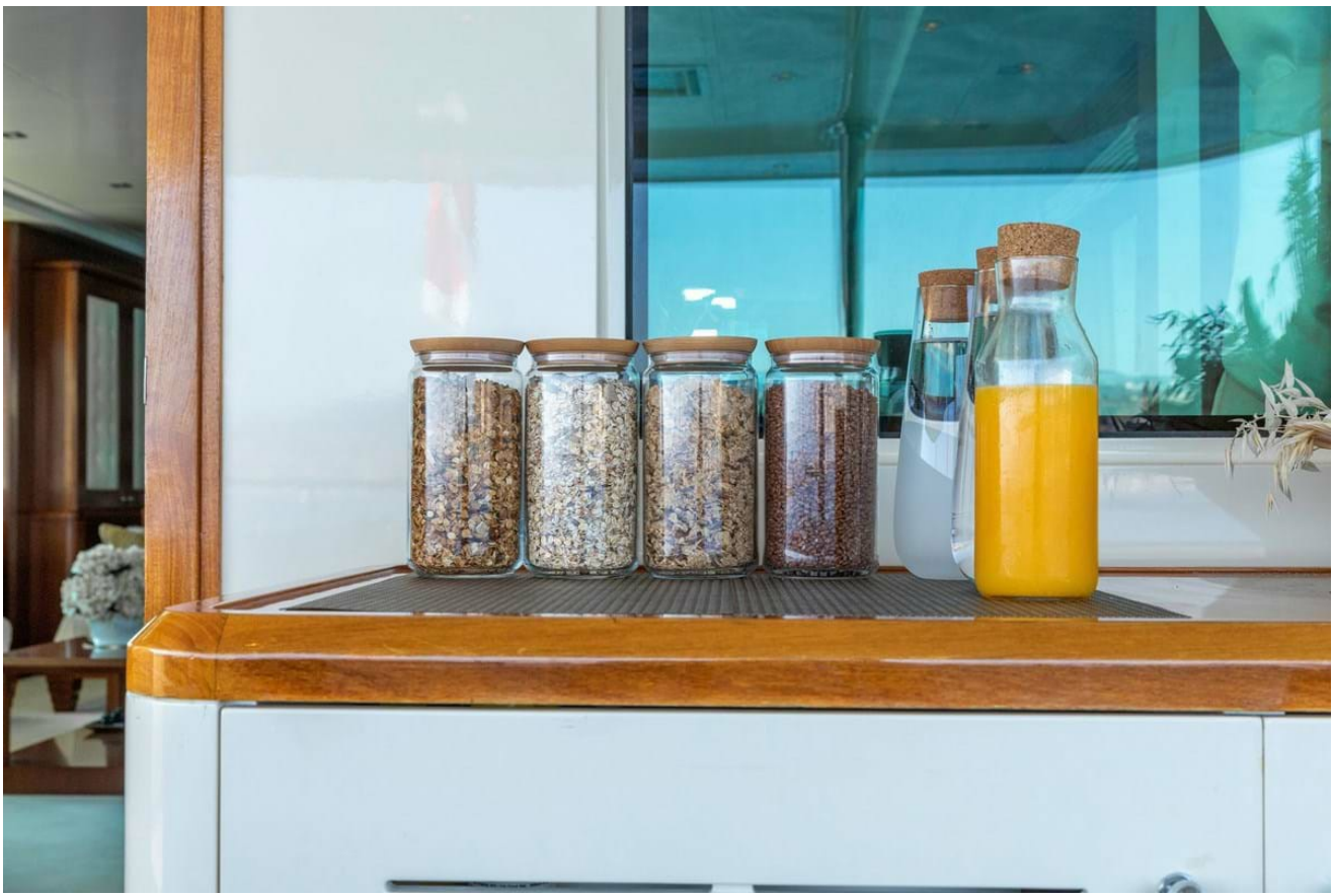
Breakfast on board