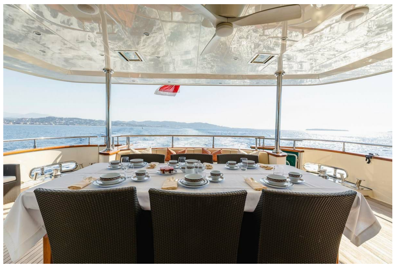
Main aft deck dining