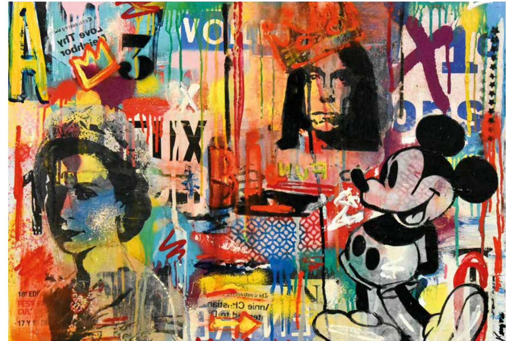
Kikayou Queen Elizabeth and below F. Fenouil Lady No 6