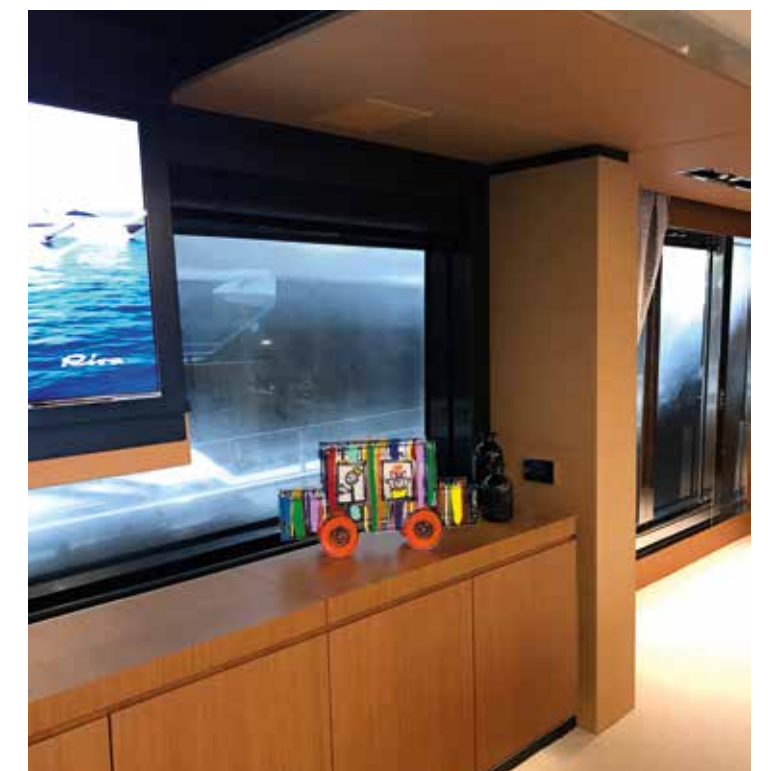
Some pieces may seem a little avant garde, but so were Andy Warhol's works now re-selling for staggering sums

"I was exposed, from a very young age, to art and museums and