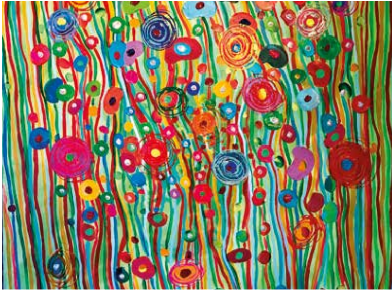
Laeti de Flo Peace top left, Sophie Feraud Graff Phantoms and below Hersk Something to Suck No 23