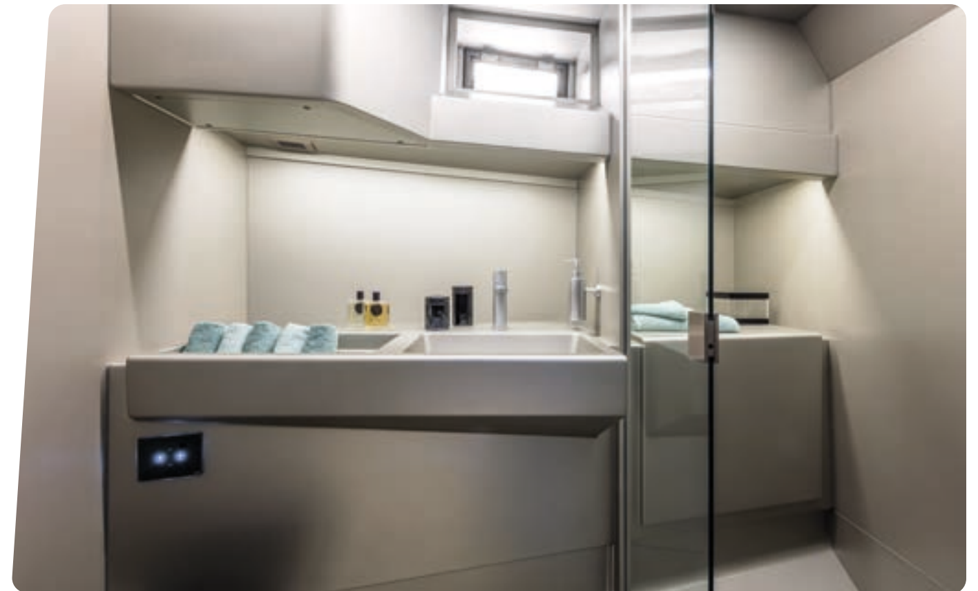
Largest bathroom in class